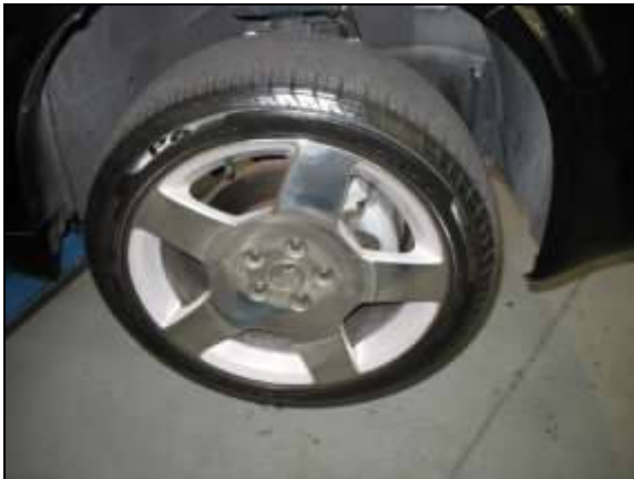
a. Remove passenger side wheel.