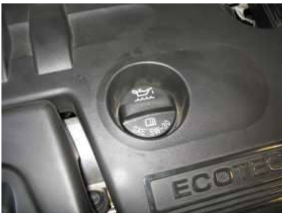
c. Remove the oil cap and then remove the engine cover. Re-install oil cap to avoid getting debris into your engine.