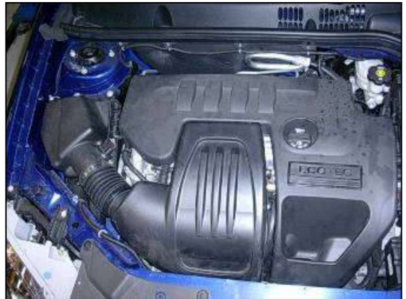
b. Factory air box system installed