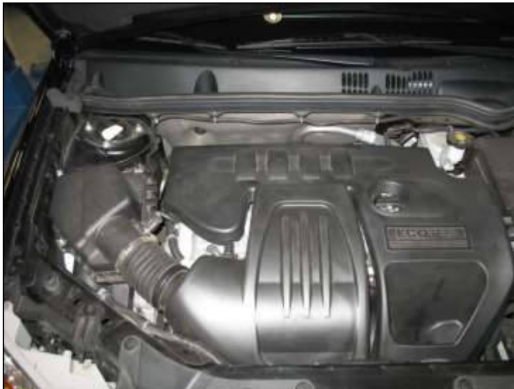
Factory air box system installed

h. Secure the stock breather hose to the intake pipe nipple using the stock hose clamp.