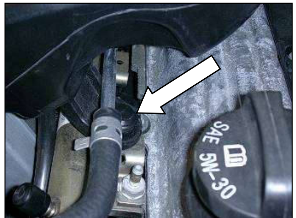
d. After removing the engine cover you will gain access to a plastic retainer near the fuel rail. Pry it open to being removal of stock air ducting.