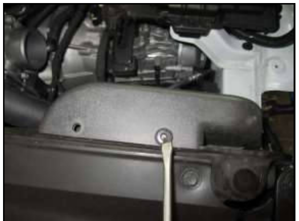
P. Push in on the center of the clips as shown and remove clips. Remove the air scoop.