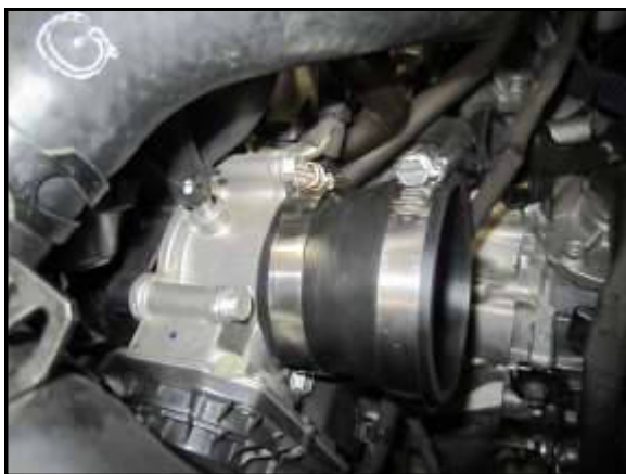
A. Install reducer coupler (B) (5-253) on the throttle body with the #40 (A) and # 48 (D) hose clamp.