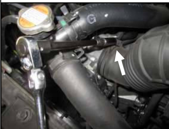
C. Loosen the clamp on the throttle body.