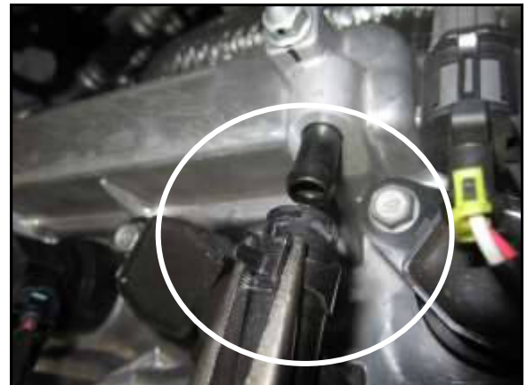
B. Release the clip on the valve cover for the PCV hose, then remove the hose from the valve cover.