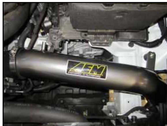
D. Install the AEM intake tube (C).