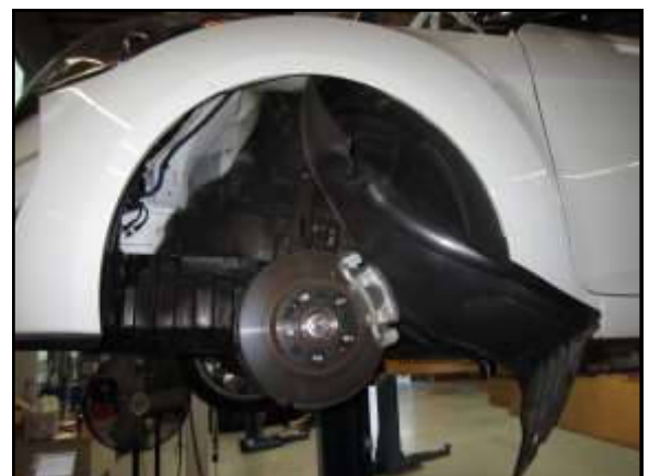
J. Move the fender liner out of the way to gain access to the resonator .