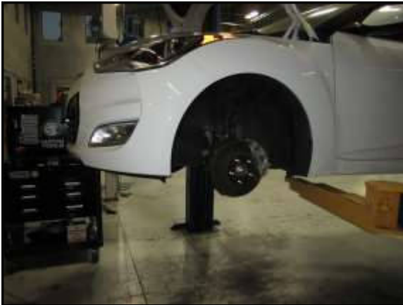
G. Raise the front of the vehicle with a jack. Support your vehicle using properly rated jack stands before wheel removal or while working under the vehicle. Remove the driver side wheel.