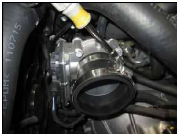
B. Tighten the #40 (A) hose clamp on the throttle body.