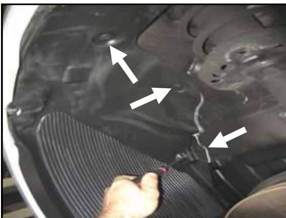
I. Remove the three upper clips on the fender liner.