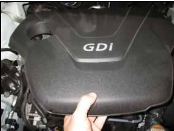
A. Lift up and remove the engine cover.