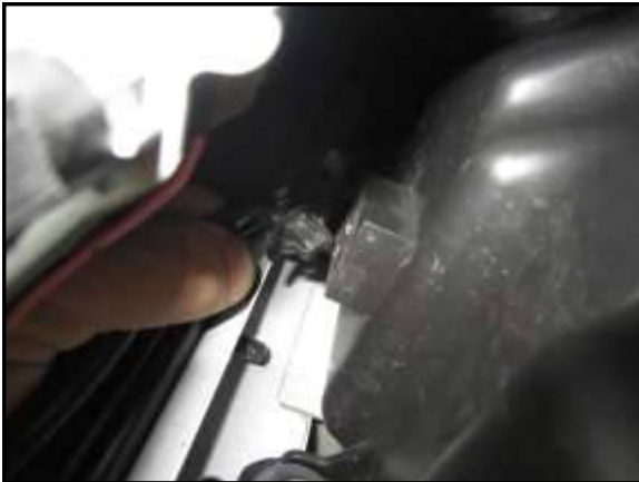
M. Release the clip holding the fog light wire harness.