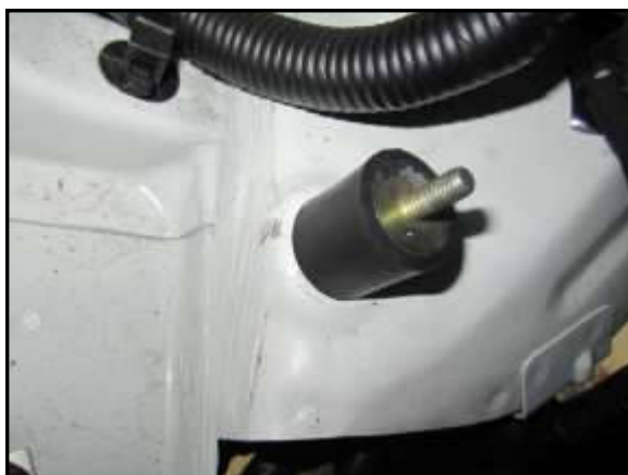
C. Install the rubber mount (J) in the OEM threaded bolt hole as shown.