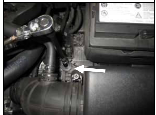
D. Loosen and remove the left 6mm bolt holding the air box.