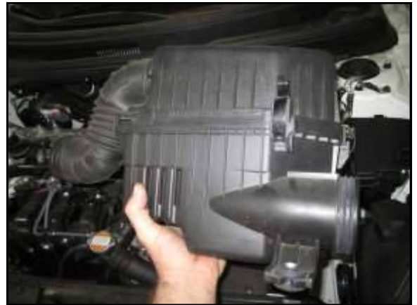
F. Now remove the stock intake system.