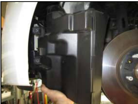
O. Remove the resonator.