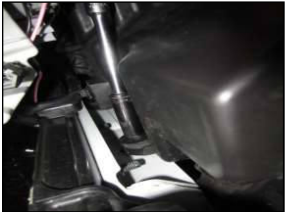
L. Remove the lower 6MM bolt on the bottom front of the resonator .