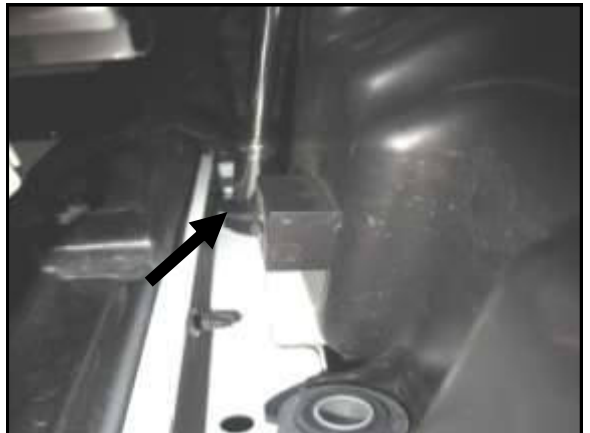
N. Remove the top front 6MM bolt holding the top of the resonator.