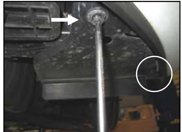
H. Remove the two lower clips on the bottom of the fender liner .