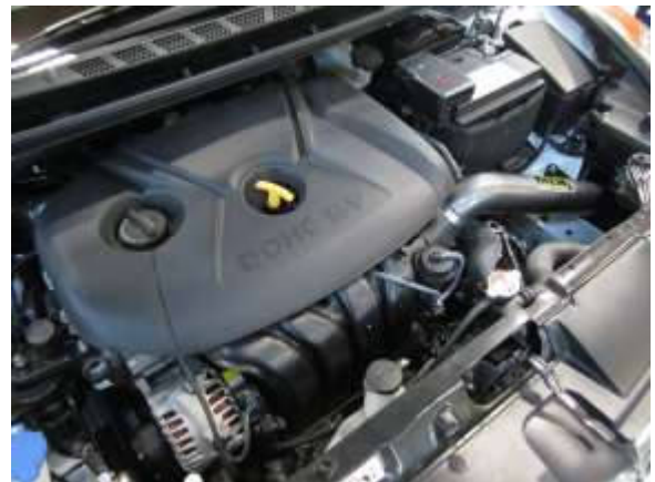
L. Re-install the stock engine cover.