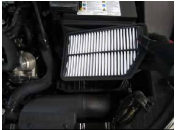
F. Remove the stock air filter. Do not discard.