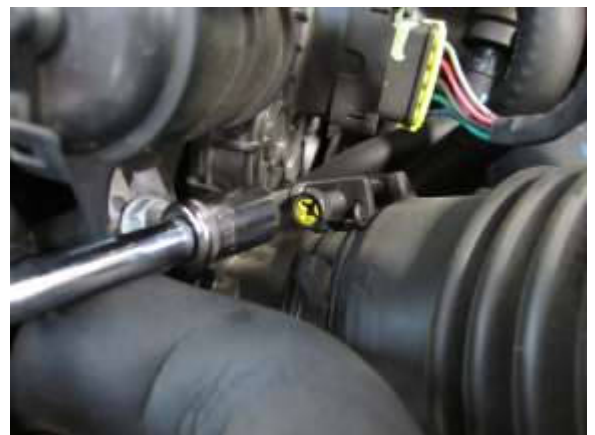
D. Loosen the hose clamp at the throttle body.