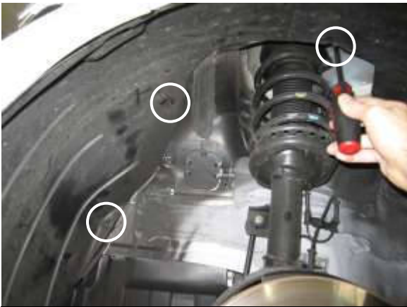
K. Unscrew and remove the three front plastic clips retaining the drivers' side fender liner. Pull the fender liner aside to expose the stock intake silencer.