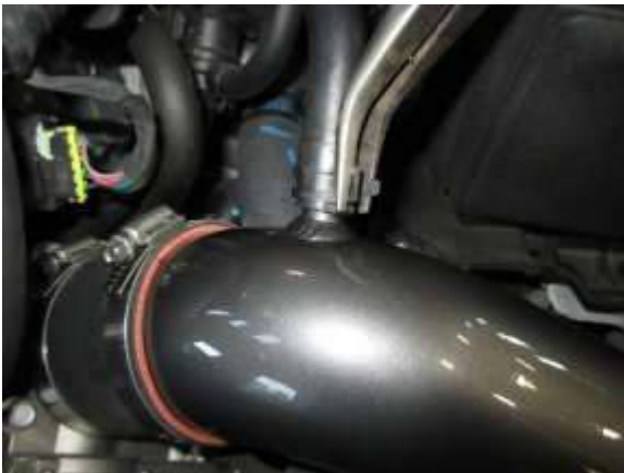
G. Connect the breather hose onto the intake tube at the breather nipple using the stock clamp as shown.