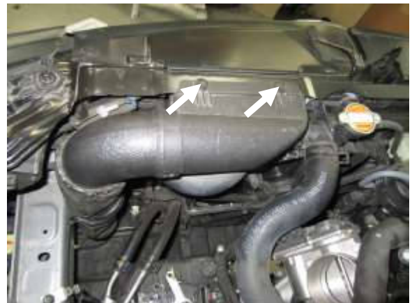
H. Depress the center buttons of the two plastic clips retaining the stock intake scoop to the radiator support. Pull up on the clips to remove them, then remove the stock intake scoop.