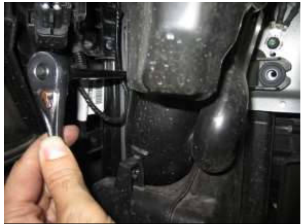
L. Inside the wheel well area, remove the three M6 bolts retaining the intake silencer to the frame support.