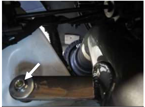
J. Now fully tighten the M6 hex nut (D) at the mounting bracket to secure the pipe into place.