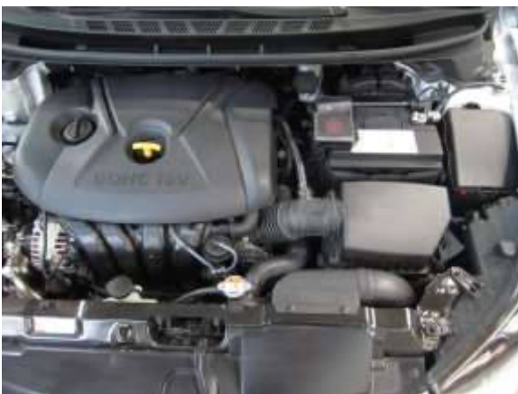
BEFORE: The stock intake system.