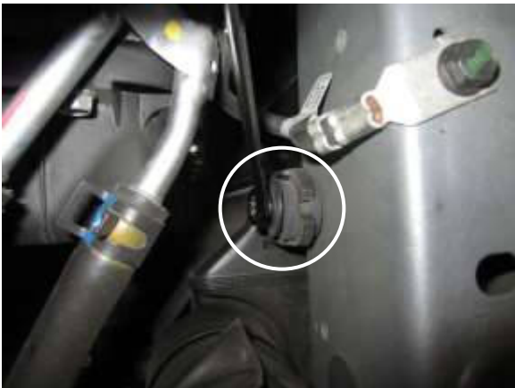
M. Under the hood, remove the 4th and final M6 bolt retaining the intake silencer to the frame support.