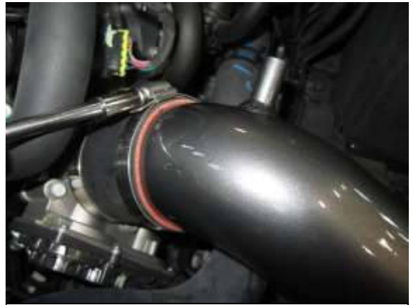
F. Connect the intake tube to the throttle body hose and gently tighten both hose clamps.