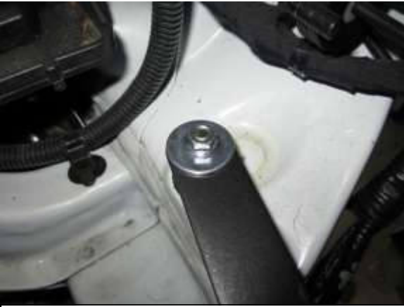
E. Loosely install the flat washer (C) and M6 flanged hex nut (D) over the M6 mounting stud as shown. Do not tighten yet.