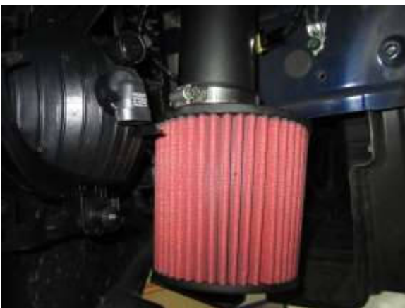
G. Inside the fender well, mount your new AEM® Dryflow™ Air Filter (G) onto the intake tube inlet. Rotate the offset filter to clear the fog lamp and the wheel well cover, and then secure with the hose clamp.