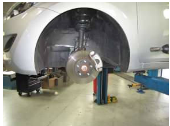
J. Raise the vehicle safely and remove the left front (driver's side) wheel. Make sure to set the parking brake, chock the rear wheels, and use proper jack stands before working under the vehicle.