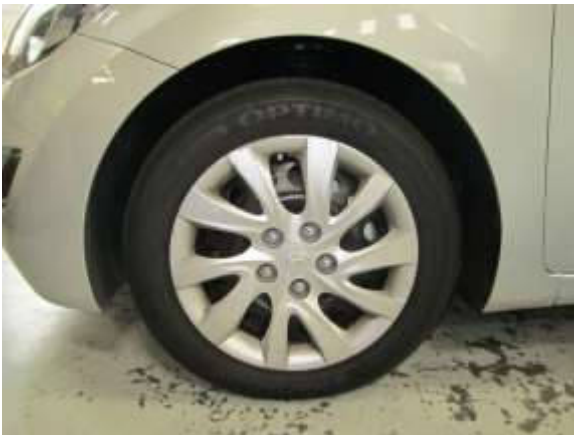
K. Re-install the driver's side wheel and torque down the lug nuts to the factory specifications found in your Vehicle Owner's Manual using a torque wrench.