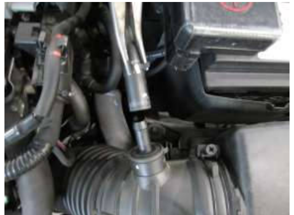
B. Disconnect the breather return hose at the stock intake tube.