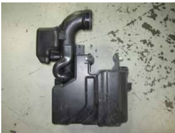
O. The stock intake silencer.