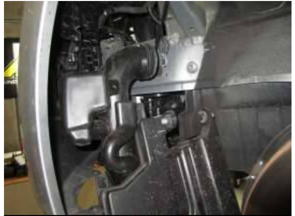
N. Lower and remove the large intake silencer from the wheel well.