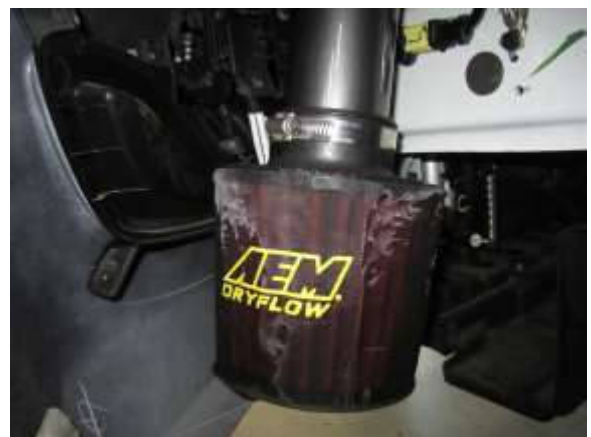
H. If you drive regularly in inclement weather, consider installing an AEM® Pre-Filter Wrap to protect your Dryflow™ filter for added peace of mind. See www.aemintakes.com for more info.