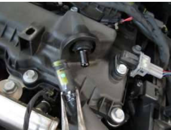
C. Disconnect PCV hose on top of the valve cover and pull it aside to expose the hose clamp at the throttle body below.