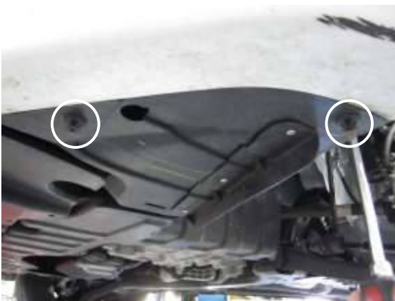
I. Using a #2 Phillips screwdriver, unscrew the 2 plastic clips retaining the plastic underside brush guard to the front bumper on the driver's side, then remove the clips.