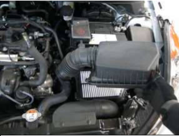
E. Unfasten the air box clamps and remove the stock air box lid and intake tube.