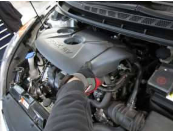
A. Open vehicle hood. Remove the plastic engine cover.