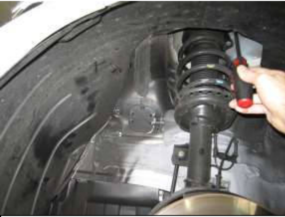
I. Reposition the plastic fender liner and brush guard under the bumper, and then re-install the 5 plastic clips you removed earlier. You can simply push them into each hole to lock in place.