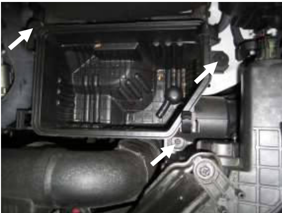
G. Remove the three M6 mounting bolts with a 10mm socket. Slide the lower air box housing to the left and remove it from the engine bay.