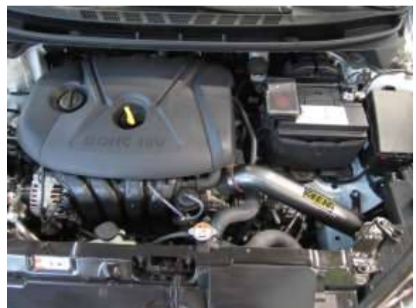
AFTER: AEM 21-718 Cold Air Intake System.