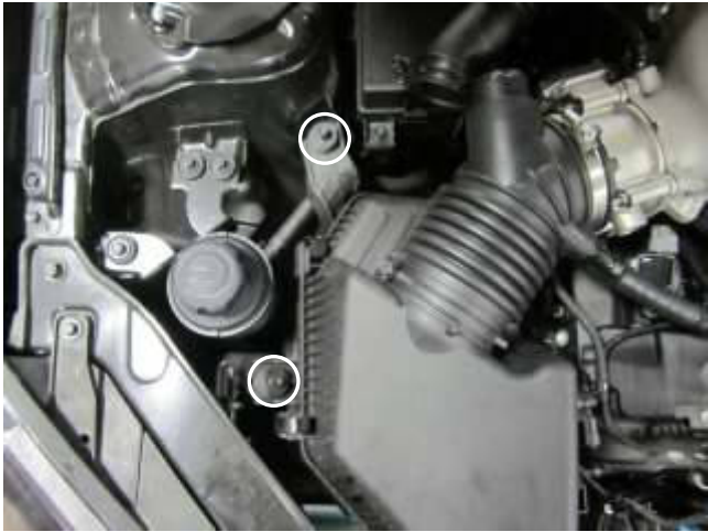
f. Remove the two bolts shown that secure the stock air box to the vehicle. Then remove the air box. NOTE: Do not discard any of your stock intake equipment.