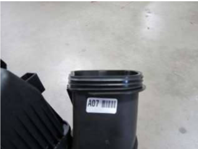
i. Remove the seal off of the stock air box. Note: This will be reused in step 3n.