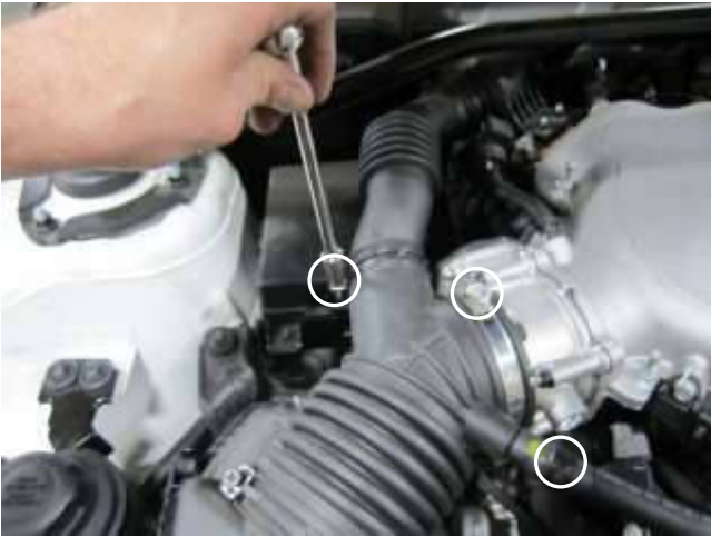
e. Loosen the hose clamps at the sound tube, the throttle body, and unclip the spring clamp on the vent line.