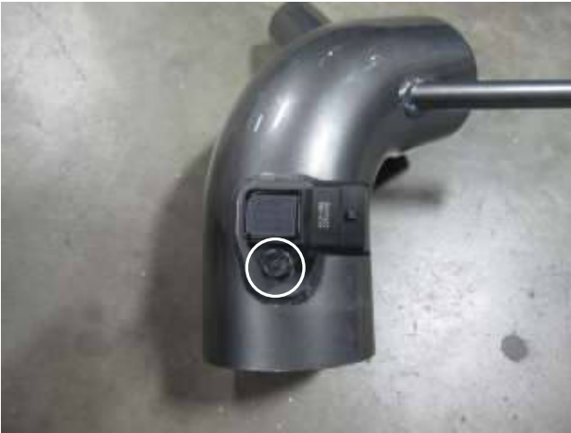
a. Install the temperature sensor into the AEM intake tube and secure with the bolt removed in step 2j.

When installing the intake system, do not completely tighten the hose clamps or mounting hardware until instructed to do so.