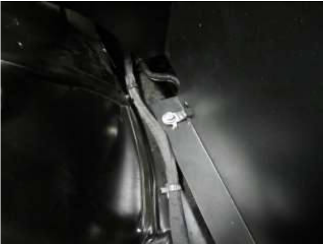
c. Install the heat shield into the vehicle on top of the spacer previously installed in step 3b. Pull the ground strap through the heat shield. Install the bolt (22224) through the two washers (1-3025 & 08275), the heat shield, and the spacer and tighten to the vehicle.