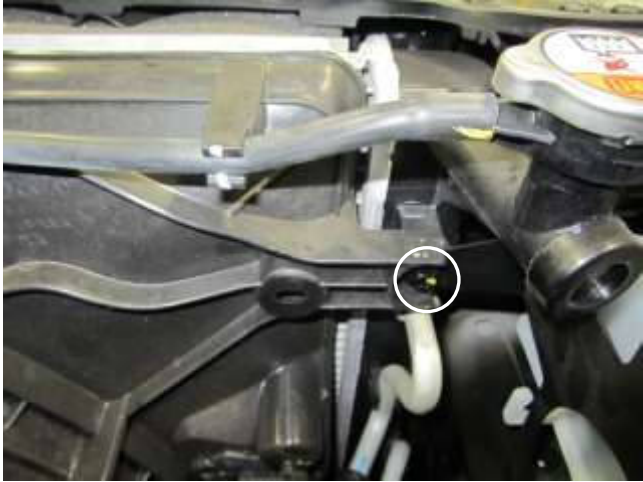
d. Align the heat shield flange with the fan shroud and install the bolt that was removed in step 2h.