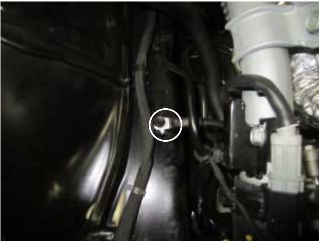
g. Remove the ground strap bolt located underneath the air box. This bolt will not be reused.