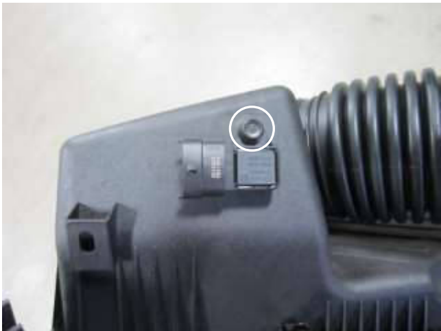
j. Loosen the bolt that secures the temperature sensor to the air box. Note: These will be reused in step 3a.