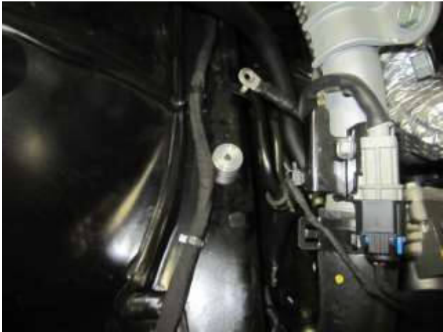
b. Install the provided spacer (06555) onto the vehicle