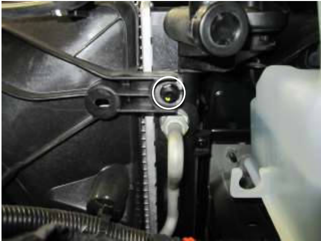
h. Remove the bolt on the front fan shroud. Note: These will be reused in step 3d.