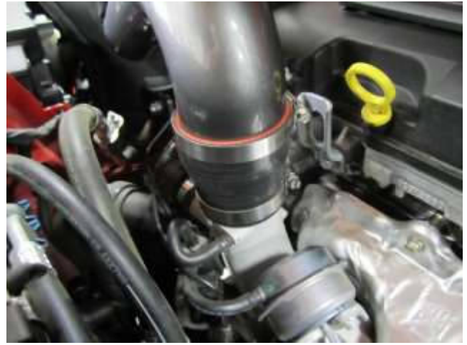
j. Install the other end of the AEM intake tube into the coupler.