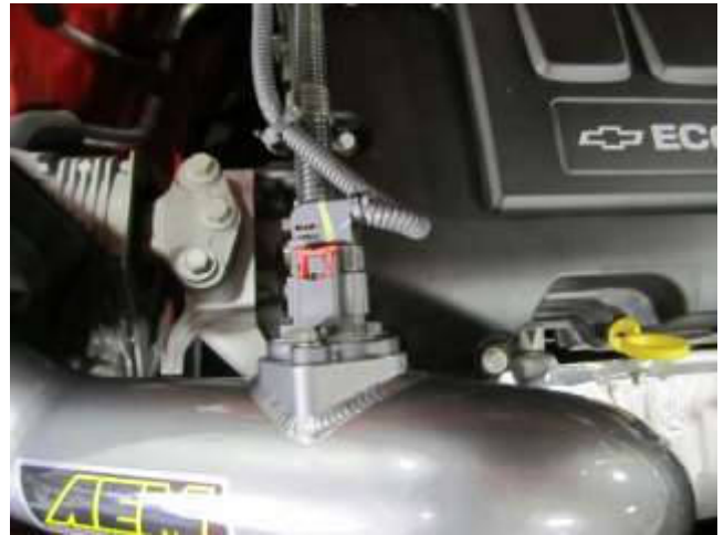
l. Reconnect the harness to the sensor that was removed in step 2a.