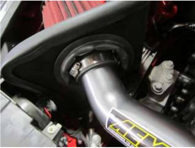
i. Install the AEM intake tube into the filter. Note: Do not fully tighten clamp at this time.