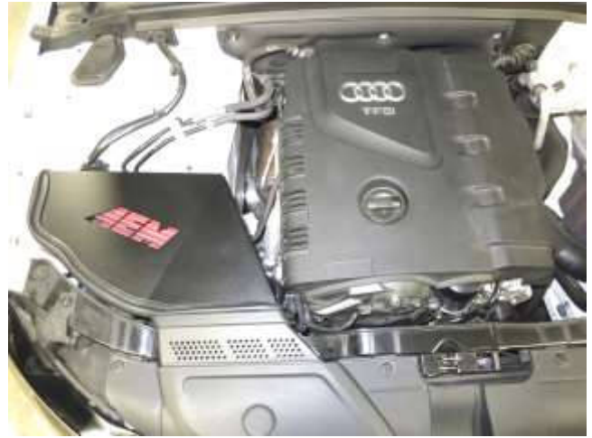
f. Finished installation of AEM Intake System.