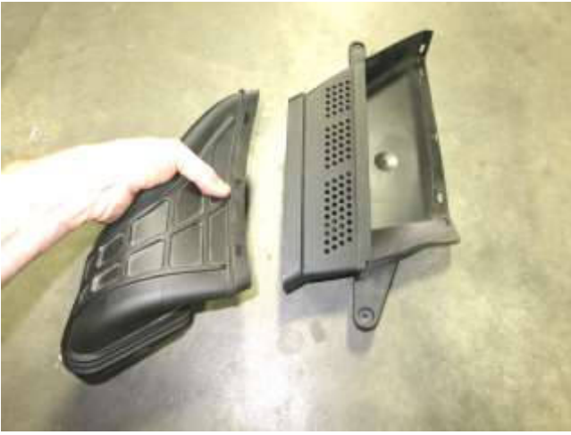
i. Disassemble the dirty air duct assembly by squeezing as shown.