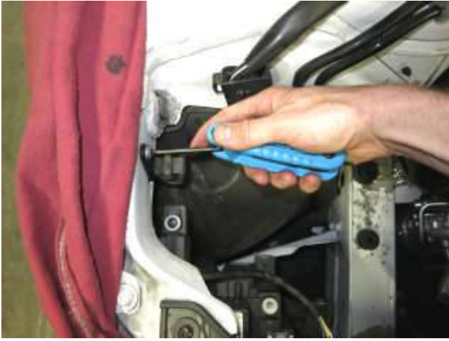
g. Use the Torx tool to remove the factory airbox mount bracket. The bolt will be re-used.