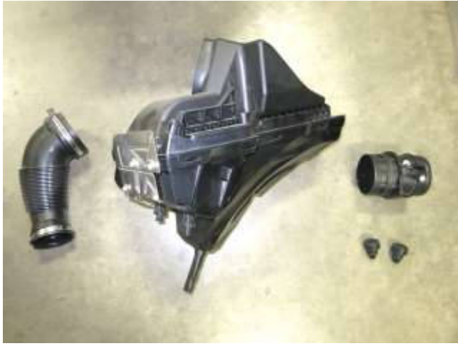
h. Use the Torx tool to separate the MAF sensor housing from the factory airbox. If the rubber feet shown in the lower right in the picture above came out of the vehicle with the airbox, put them back in their holes in the chassis rail.