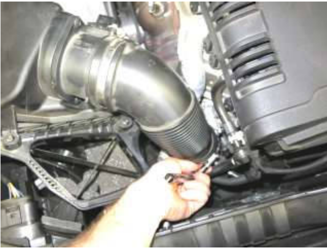
e. Disconnect MAF sensor and loosen the clamp securing the factory clean-air duct to the turbocharger.