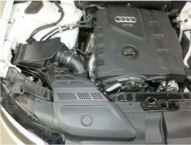
e. Factory air induction system.