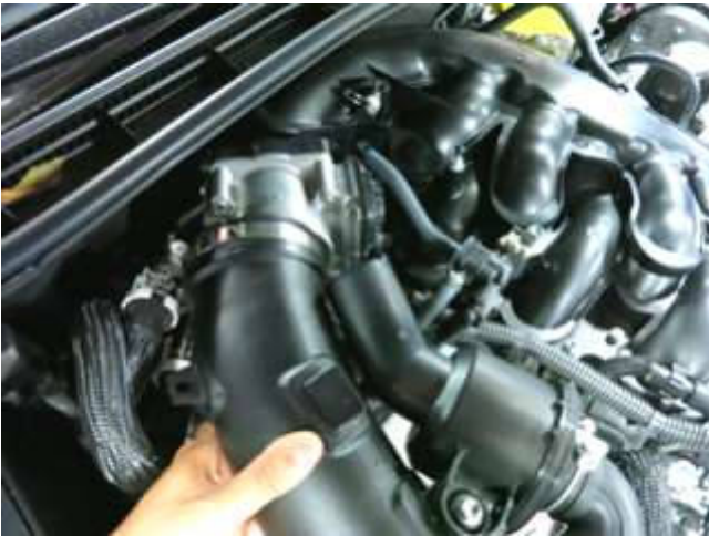
g. Loosen the hose clamp and slide the stock tube off the throttle. Remove the stock intake system.