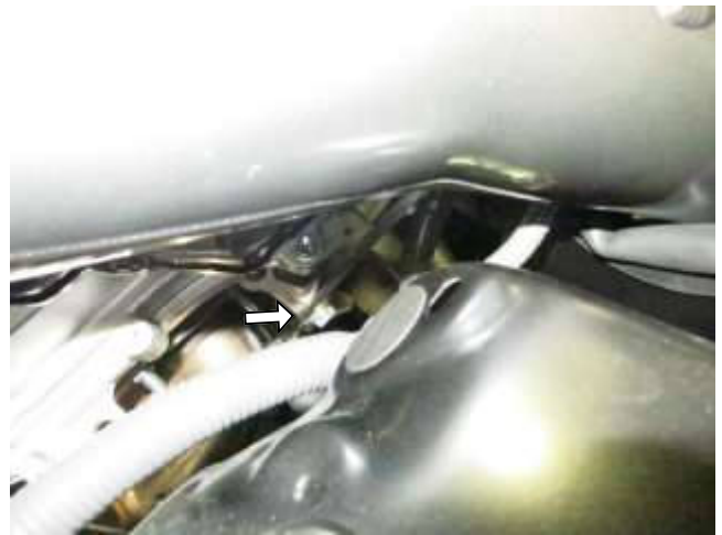
h. Align the mounting bracket as shown. Fasten the M8 bolt installed from step 3c using a 13mm wrench.