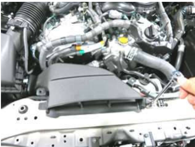
c. Use a 10mm socket to remove the M6 bolt securing the fresh air inlet duct. Detach the air duct from the lower airbox and set aside.