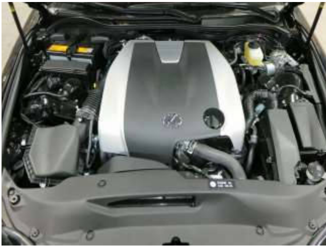
o. Factory air induction system.