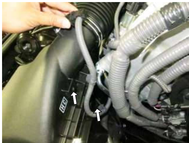
d. Disconnect the two tree mount clips securing the MAF harness to the stock airbox. Unclip the harness from the MAF sensor as shown.