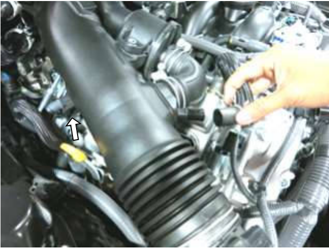
e. Unclip the vacuum hose clip on the lower side of the intake tube. Disconnect the PCV tube as shown.