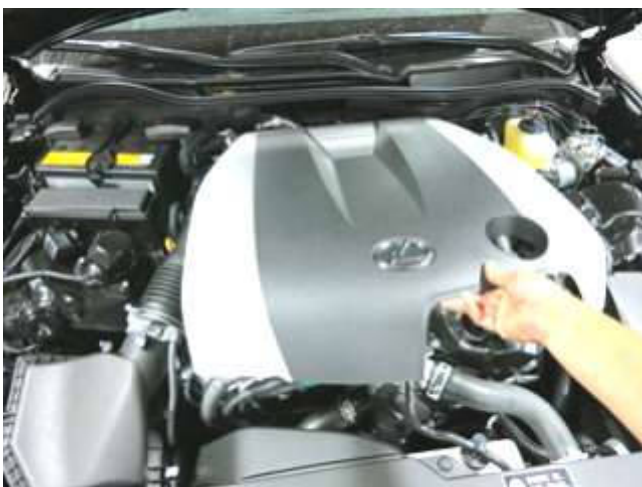
a. Lift up on the engine cover to loosen and carefully set it aside.