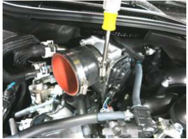
f. Install the provided coupler (5-323 for IS250 models and 5-325 for IS350 models) and fasten the hose clamp over the throttle.