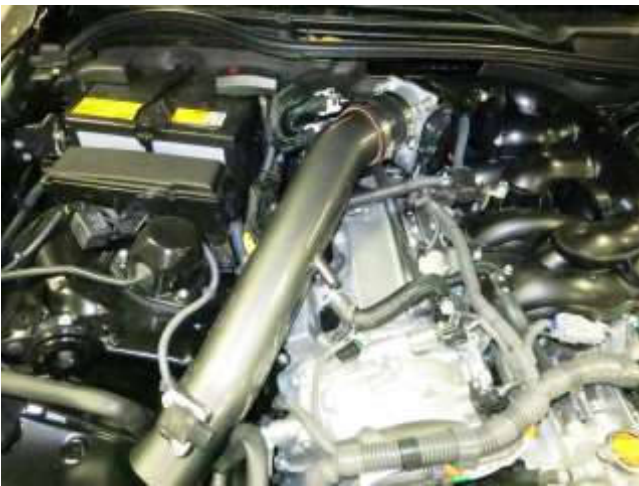
g. Position the AEM tube into the coupler as shown.