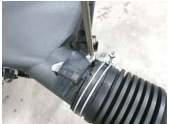
h. Use a Philips screwdriver to remove the MAF sensor from the stock intake tube.