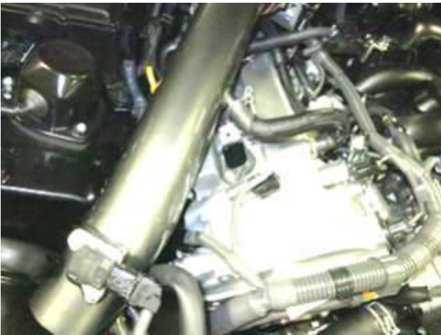
i. Reconnect the PCV hose to the AEM tube provision and the harness to the MAF sensor.