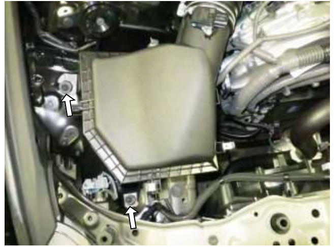
f. Loosen and remove the two M6 bolts indicated.