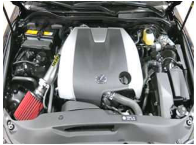
p. Finished installation of AEM Intake System.