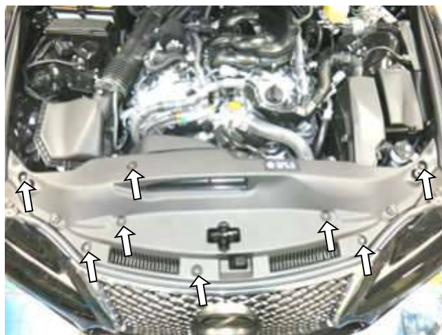
b. Depress the 8 plastic clips indicated and remove the plastic upper fascia.