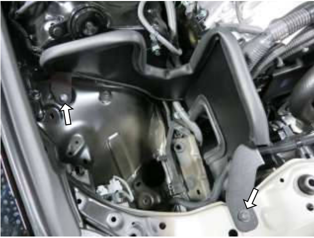
e. Install the AEM heat shield as shown and fasten the inner tab with the m6 bolt(1-2038). Fasten the upper tab using the bolt removed in step 3b.