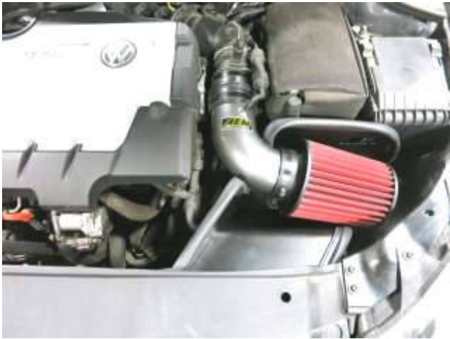
l. When the intake tube is properly aligned, tighten all hose clamps and tighten the M6 nut securing the intake tube bracket.