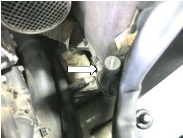
f. Install the supplied rubber mounted stud over the heat shield tab into the threaded boss on the air box tray.