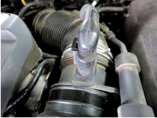
j. Connect the MAF sensor electrical connector to the MAF sensor.