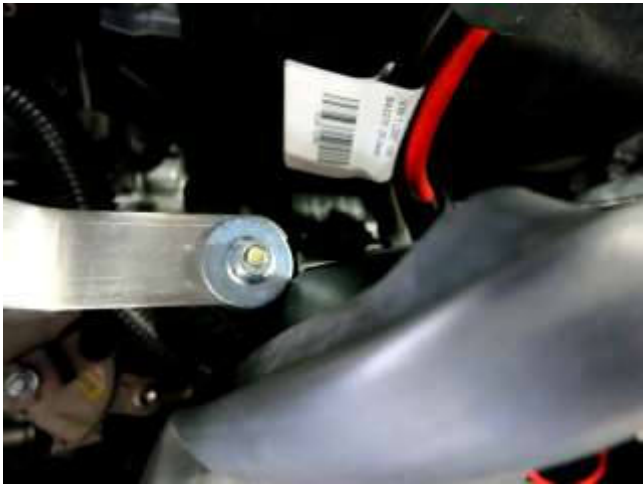
h. Install the supplied M6 nut and washer over the rubber mounted stud but do not fully tighten.