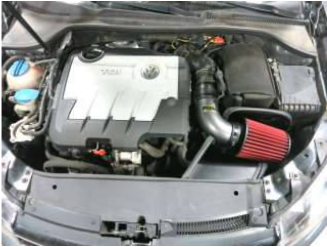
n. AEM air intake system installed