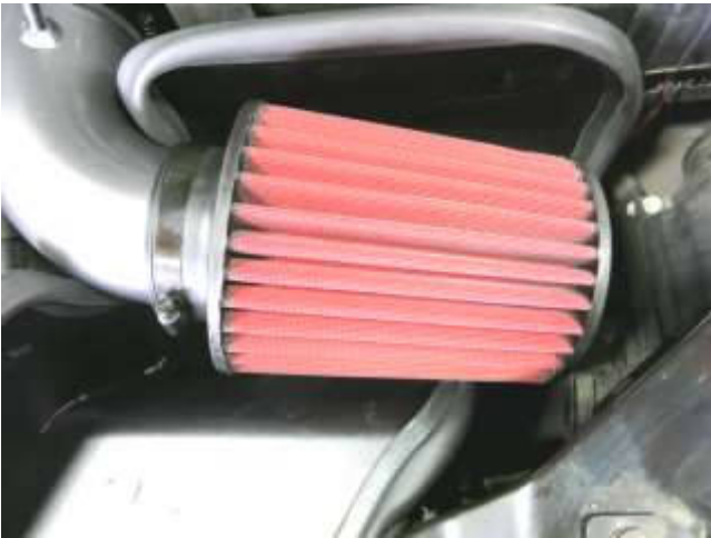
i. Install the AEM air filter onto the intake tube and tighten the hose clamp slightly.