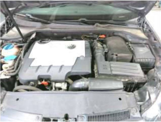
m. Stock intake system