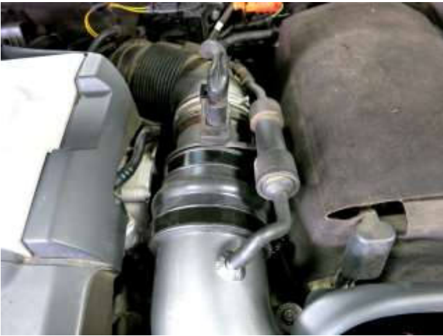
k. Connect the vacuum line to the fitting on the AEM intake tube. Cap off the port with supplied cap if your application does not have the vacuum line.