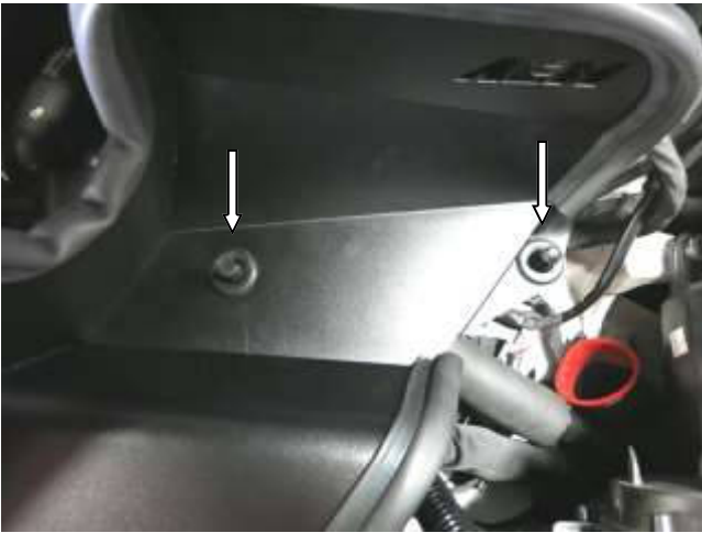
e. Install the heat shield assembly into the vehicle by fitting the grommets over the posts on the air box tray. Fully seat grommets on post. Fitment will be tight.