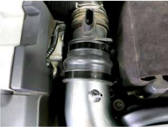
g. Install the supplied coupler, clamps, and intake tube onto the factory MAF sensor and align the tube bracket to the rubber mounted stud.