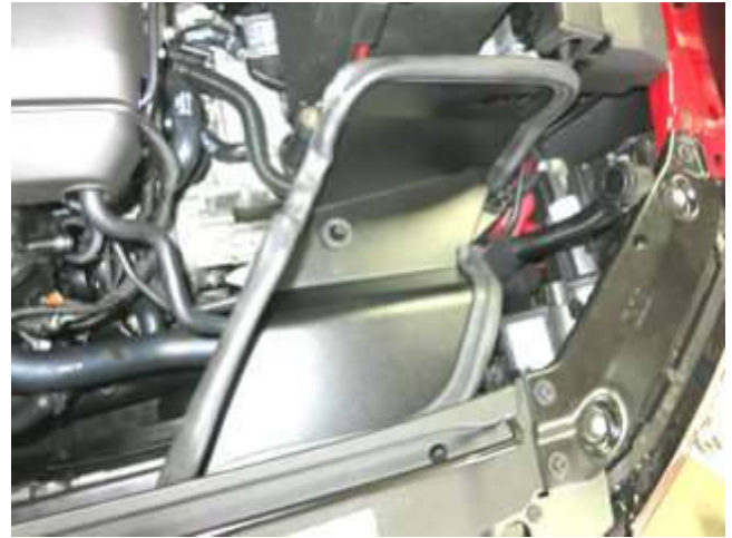
a. Assemble the heat shield according to the diagram on pg2 and install with rubber mount. Lube grommets with glass cleaner if needed to squeeze grommets onto posts.