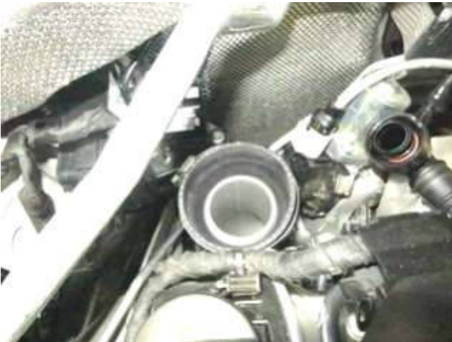
b. Install the turbo-end coupler and both corresponding hose clamps onto the turbo.