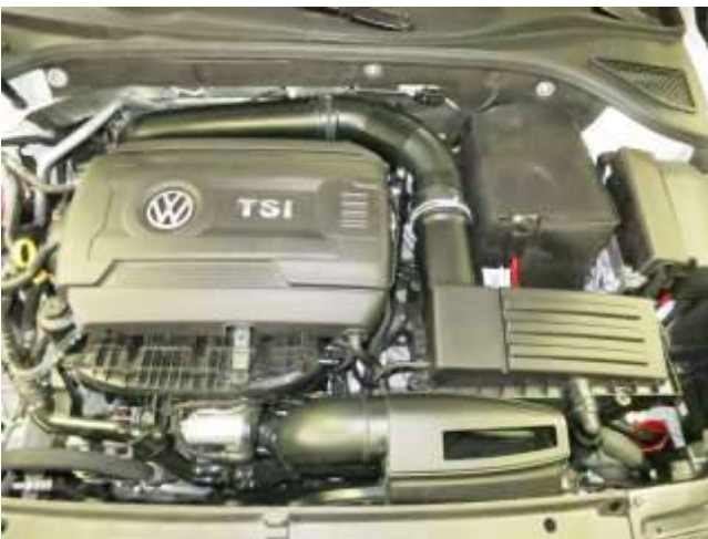
f. Factory air induction system.

e. Route the retained hose from the airbox to the end of the filter and rotate the fitting in the end of the hose to align it with the end of the filter. Install the adapter into the end of the filter and rotate the filter for best alignment before inserting the hose into the fitting until it clicks to indicate engagement on both sides. Torque all three hose clamps to 30 in-lbs. If your vehicle does not have air injection system, install the supplied 8-215 cap to the 088012 adaptor.