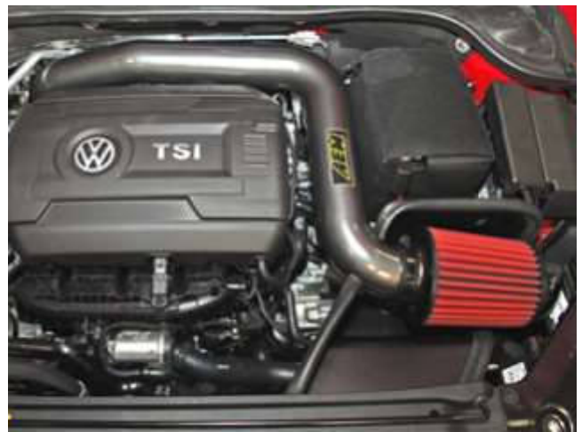
g. Finished installation of AEM Intake System.