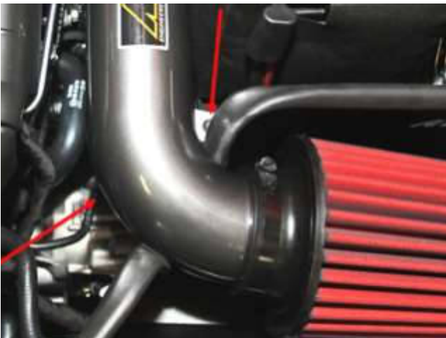
d. Attach the small vacuum hose and install filter. Mount your new intake tube to the rubber mount with the supplied fastener and washer. Do not tighten yet.