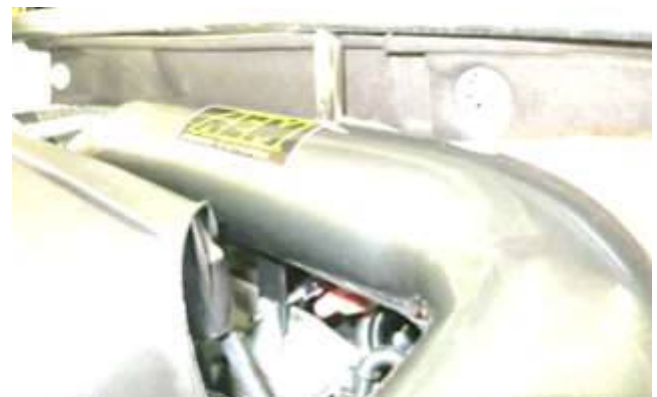
e. Reinstall the tube mounting bolt taking care to position your new intake tube with clearance all around. Tighten both tube mounting bolts.