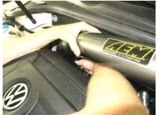
c. Rotate the end of the PCV hose & push it straight in to the corresponding port on the bottom of your new intake tube until fully engaged, then install the tube into the turbo-end coupler. Do not tighten clamps yet.