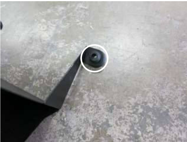
c. Install the rubber grommet into the AEM heat shield that was removed in step 2m.