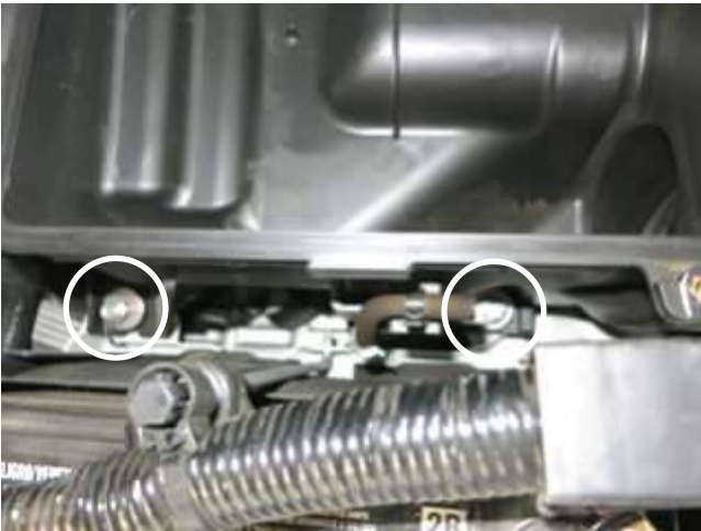
g. Loosen the (2) bolts that secure the lower air box to the vehicle.