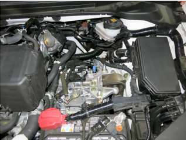
k. Remove the lower air box from the vehicle.