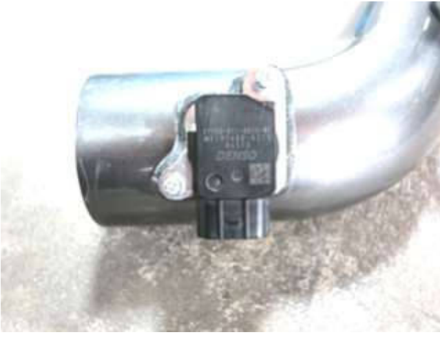
a. Install the MAF sensor and screws into the AEM intake tube that were removed in step 2n.

a. When installing the intake system, do not completely tighten the hose clamps or mounting hardware until instructed to do so.