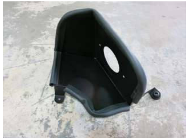
d. Install the supplied edge trim around the heat shield as shown and trim off excess if necessary.