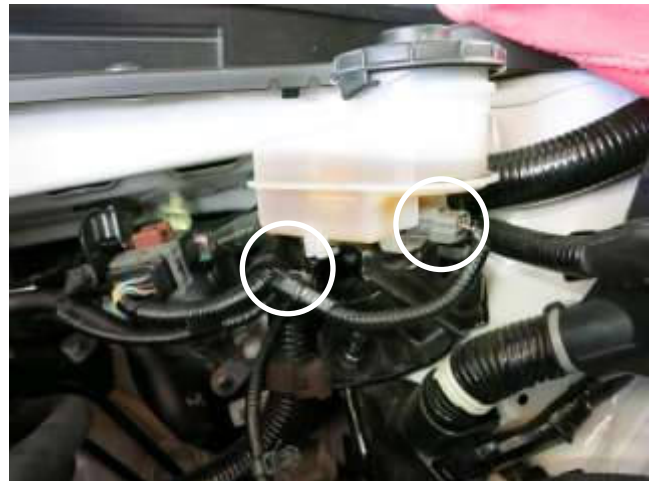
j. Disconnect the electrical connector and the clip securing the wire loom to the brake reservoir.