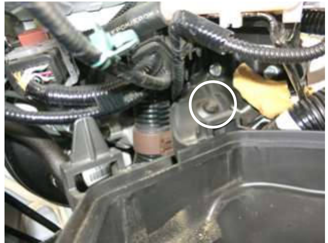
h. Pull the rear of the lower air box off the push in grommet located underneath the brake fluid reservoir. Note: Soapy water can help disengaging the grommet from the stud.