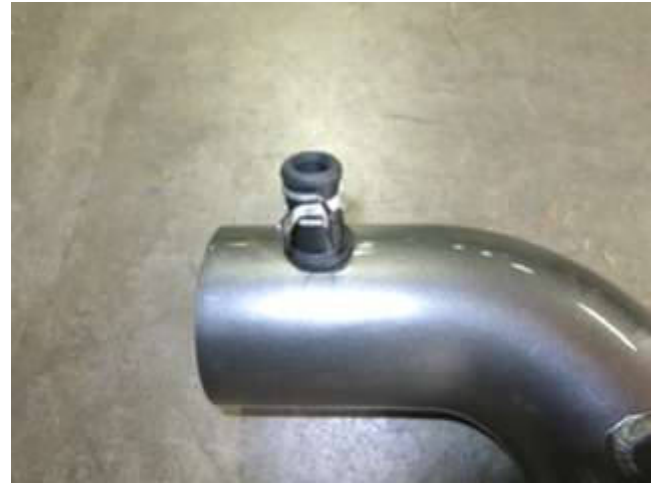
b. Install the supplied PCV adapter and the spring clamp removed in step 2l. into the AEM intake tube.