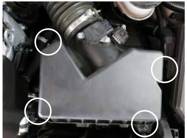
d. Loosen the (4) bolts that secure the upper air box to the lower air box.