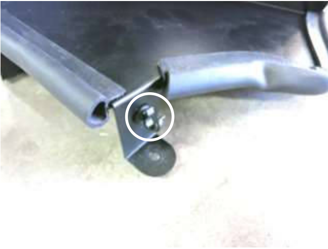
g. Install the clip that was removed in step 2o. into the heat shield as shown.