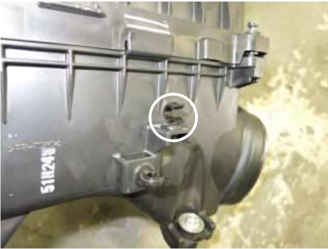
o. Remove the clip on the front of the lower air box by squeezing the tabs together. Note: This will be reused in step 3g.