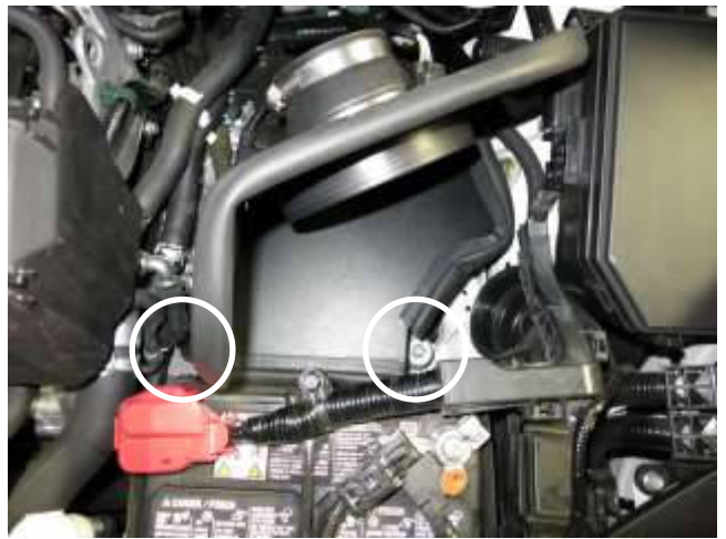
j. Align the front two heat shield tabs with the rubber mounts and install the supplied washers and nuts. Tighten the nuts at this time.