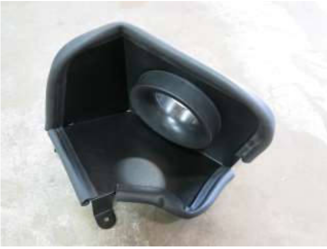
e. Install the filter adapter into the heat shield and secure with the supplied hardware as shown in the exploded view.