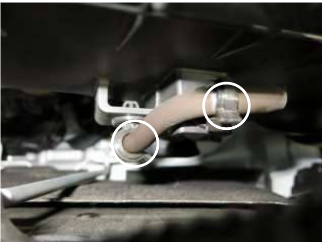
i. Located in the front of the lower air box, remove the vent hose from the clips.