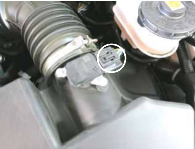
a. Disconnect the Mass Air Flow (MAF) sensor connector from the sensor.