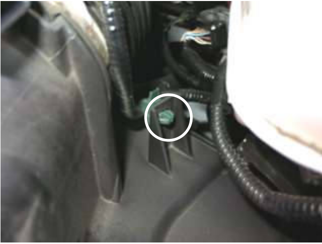
e. On the upper air box, disconnect the push-in tab that secures the MAF sensor wire loom to the upper air box.