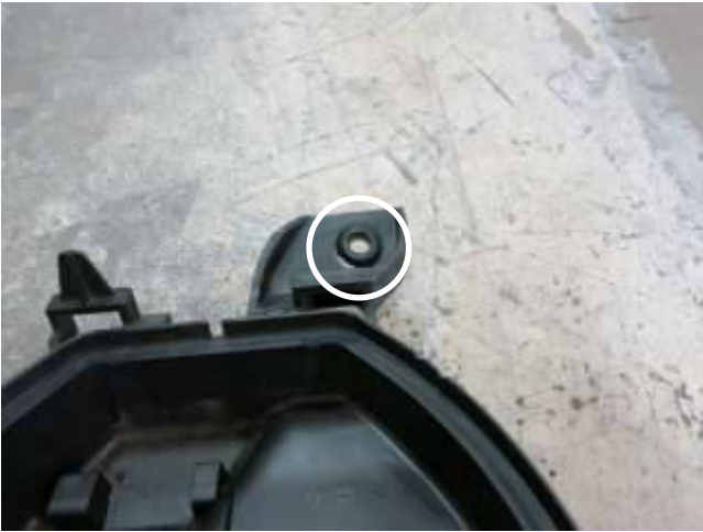
m. Remove the grommet from the lower air box. Note: Sometimes this can get stuck on the vehicle instead of the lower air box. This will be reused in step 3c.