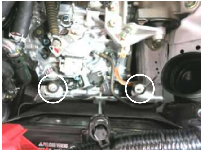
h. Install the two rubber mounts into the vehicle. The shorter mount will go closest to the engine.