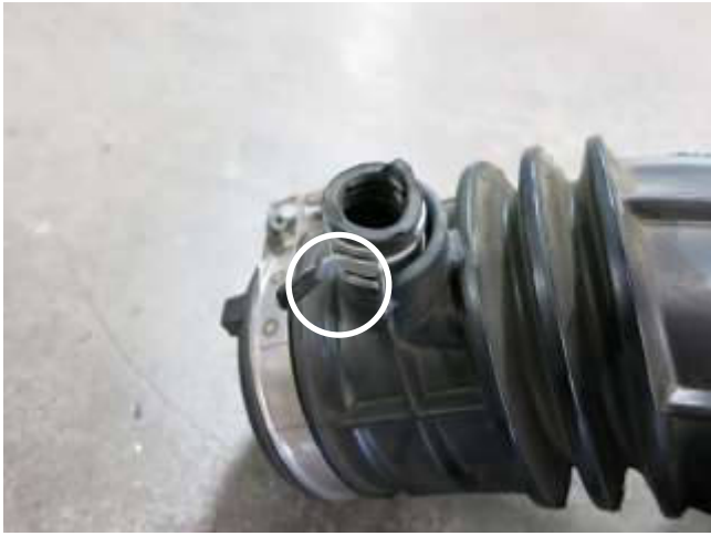
l. Release the pressure off the spring clamp and remove it from the stock intake hose. Note: This will be re-used in step 3b.