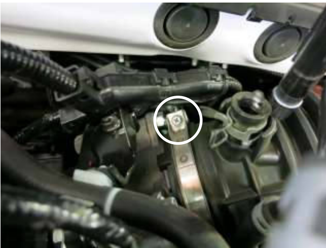
c. Loosen the hose clamp at the throttle body.