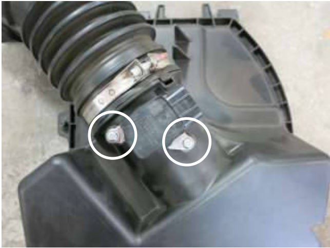
n. Remove the screws securing the MAS to the upper air box lid. Note: The MAS and screws will be re-used in step 3a.