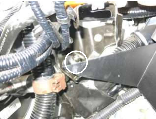
i. Install the heat shield into the vehicle and align the rear tab/rubber grommet with the stock mounting location. Note: Soapy water will help with installation.