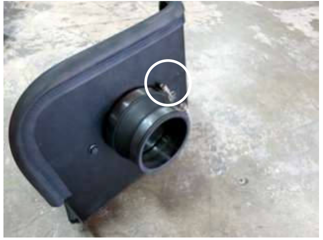
f. Install the supplied coupler onto the filter adapter with the correct hose clamps. Tighten the hose clamp closest to the heat shield at this time.