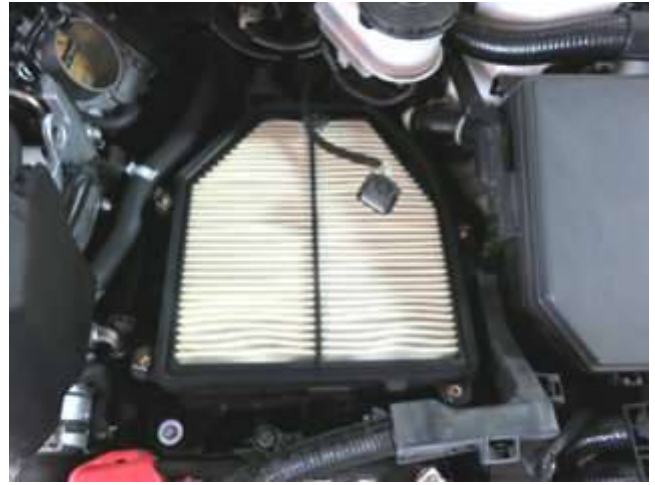
f. Lift the upper air box and stock intake hose out of the vehicle. Then, remove the stock air filter.