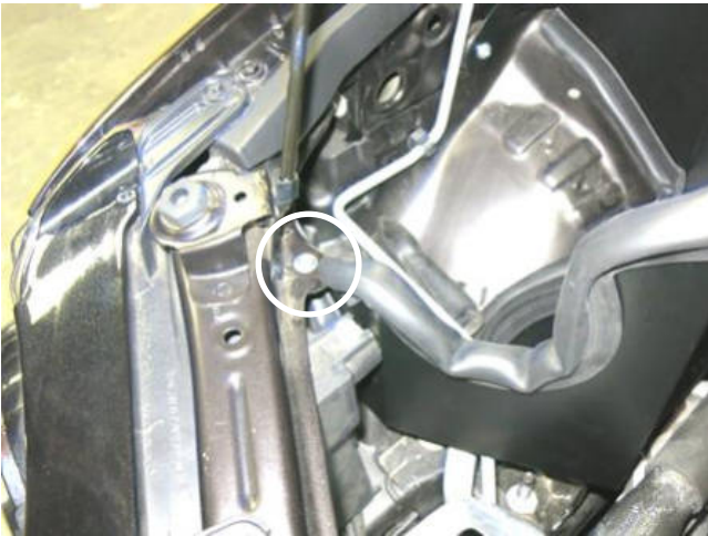
e. Make sure the AEM heat shield is under the lip of the core support, and install the provided bolt/nylon washer securing the AEM heat shield to the vehicle. NOTE: On vehicles equipped with projector head lights it will be necessary to install the bolt from the bottom up.