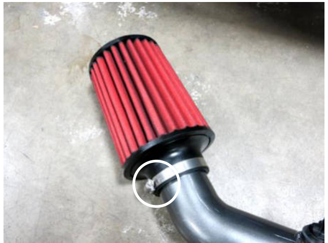
h. Install the AEM filter onto the AEM intake tube and secure with the provided hose clamp.