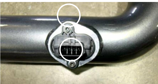
g. Install the mass air flow sensor into the AEM intake tube that was removed in step 2f. and secure with the provided hardware.