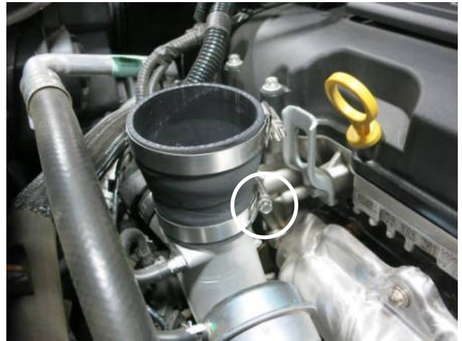
f. Install the coupler and provided hose clamps on to the turbo compressor inlet. Tighten the hose clamp closest to the compressor at this time.