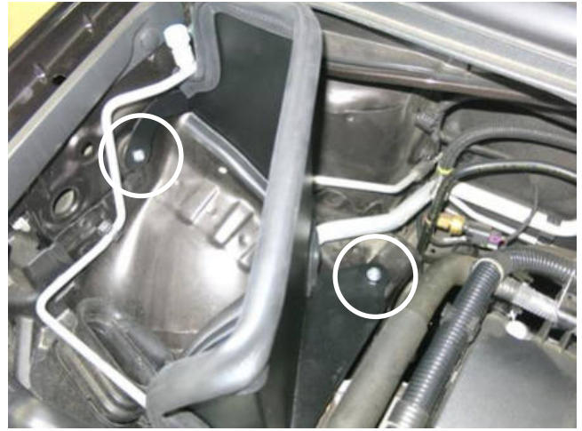
d. Install the completed AEM heat shield into the vehicle aligning the mount on the inner fender and rear rubber grommet.