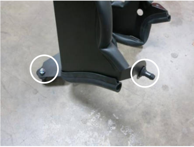
c. Install the provided hardware onto the AEM heat shield as shown. See the diagram on page 2 for parts and part number references.