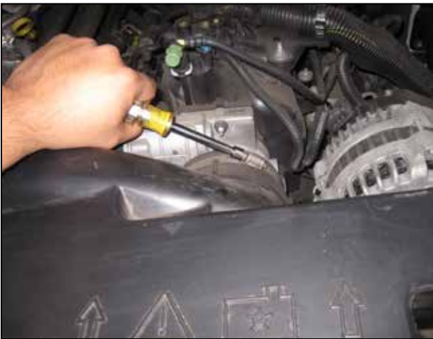
g. Loosen the hose clamp securing the intake duct to the throttle body.