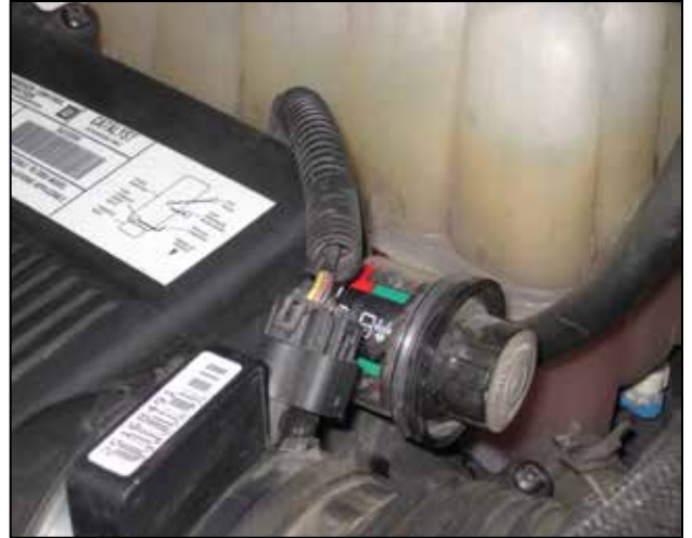
b. Disconnect the mass airflow (MAF) sensor harness.