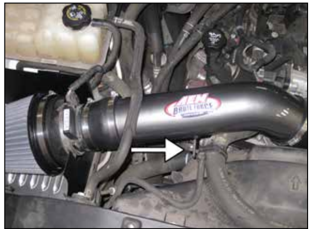
q. Secure the plastic mount on the radiator hose to the intake pipe.