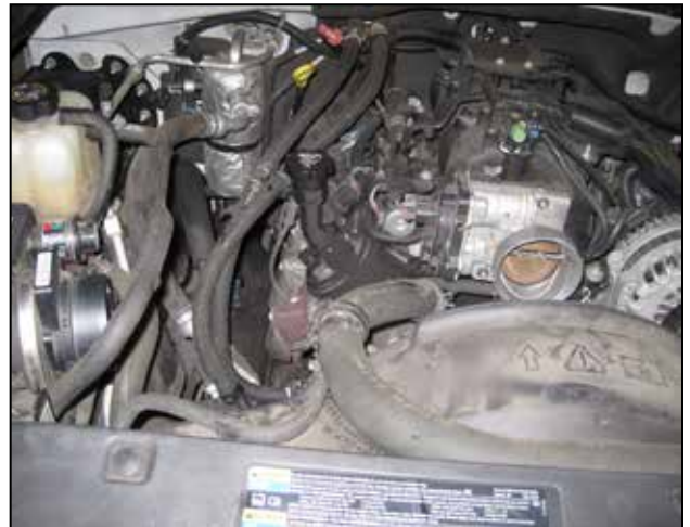
j. Remove the intake duct from the vehicle.