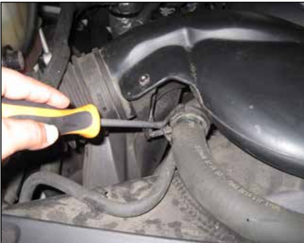
c. Disconnect the plastic mount securing the radiator hose to the intake duct.