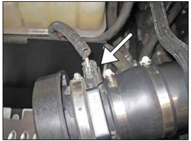
o. Reconnect the MAF sensor harness to the MAF sensor.