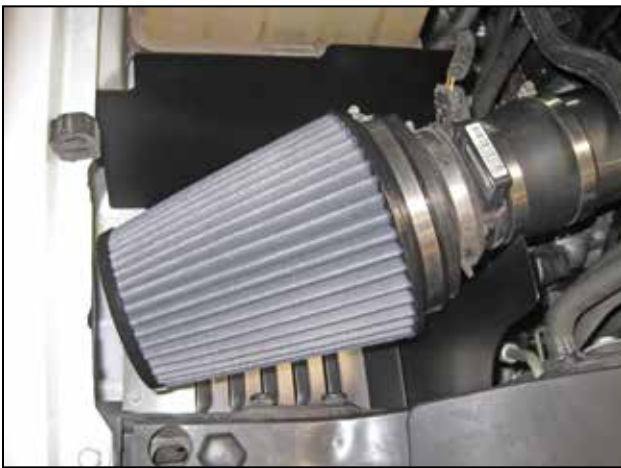
p. Install the air filter onto the adapter.