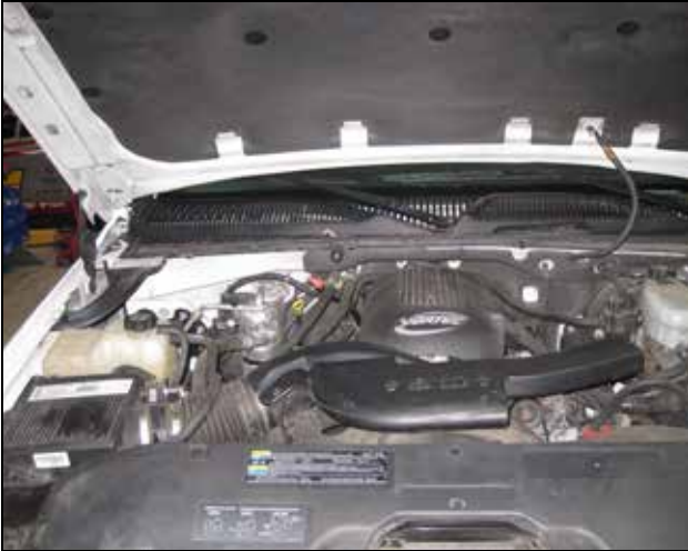
a. Stock air box system.