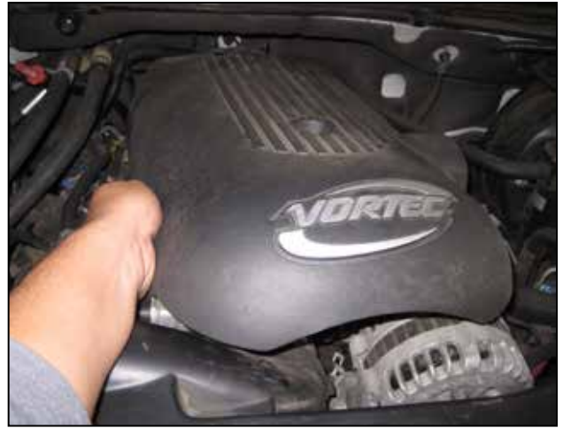
f. Remove the engine cover.