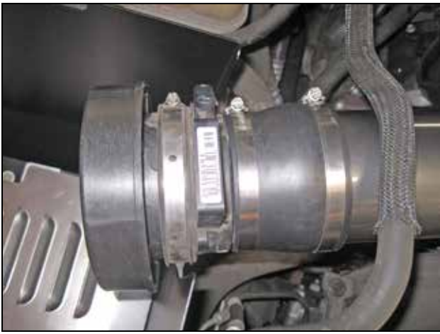
n. Install the MAF sensor assembly (assembled in the previous steps) onto the intake pipe.