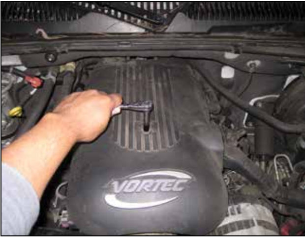
e. Remove the bolt securing the engine cover.