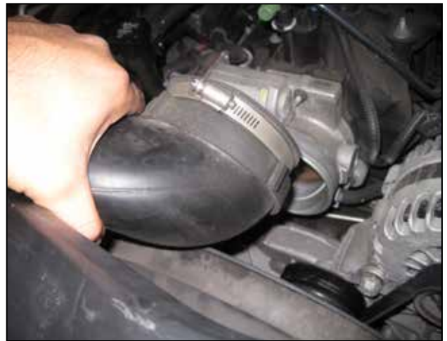
h. Pull the intake duct away from the throttle body.