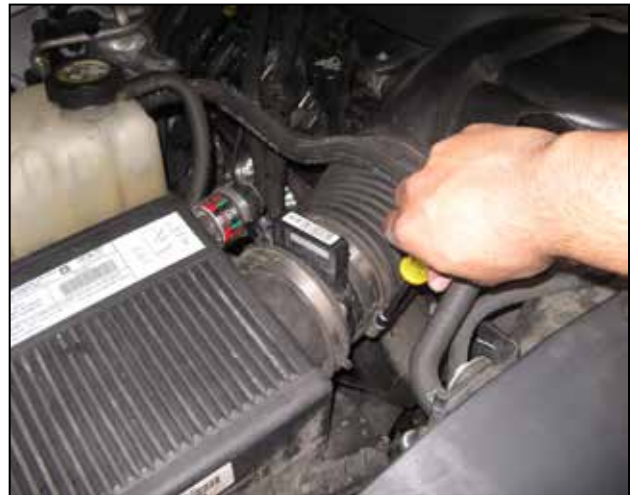
d. Loosen the hose clamp securing the intake duct to the MAF sensor.