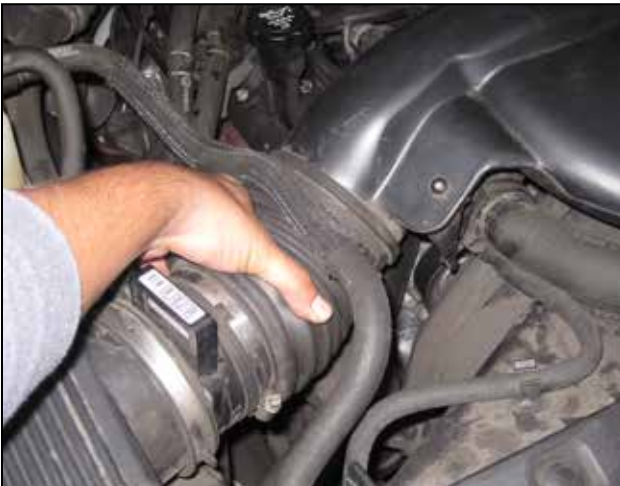
i. Disconnect the intake duct from the MAF sensor.