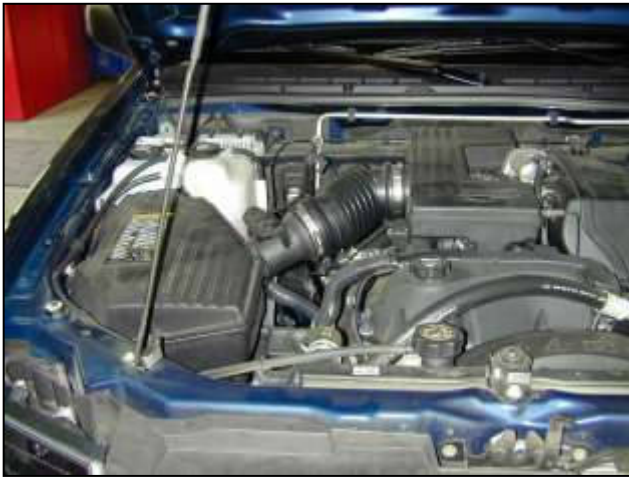
a. Factory air box system installed.