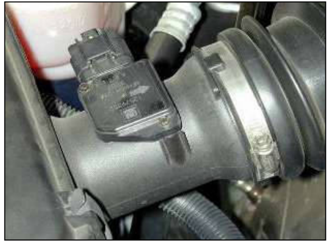
b. Unplug the wire harness from the Mass Air Flow (MAF) sensor. Remove the two screws retaining the MAF sensor and carefully remove the MAF sensor.