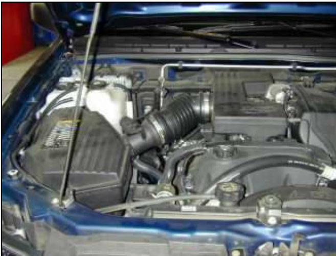
Factory air box system installed

I. Position the AEM® intake for best fitment. Be sure that the pipe or any other component is not in contact with any part of the vehicle. Tighten the hose clamps at the throttle body. Tighten the nut on the mounting bracket. Re-adjust pipe if necessary. Re-connect the MAF wire harness.