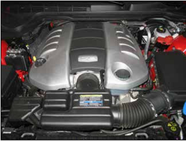
Factory air box system