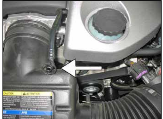
b. Unclip breather hose from resonator chamber