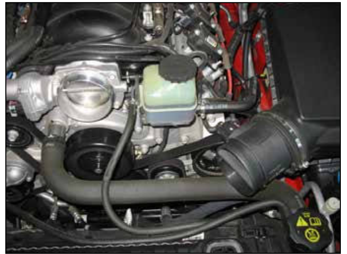
d. Remove the inlet tube.