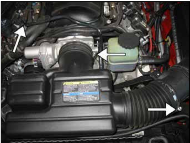
c. Remove engine cover (lift up and pull forward). Loosen hose clamps on the inlet tube at the throttle body and MAF body. Also disconnect and remove the breather hose from the valve cover.