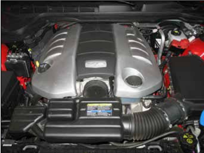
a. Factory air box system installed.