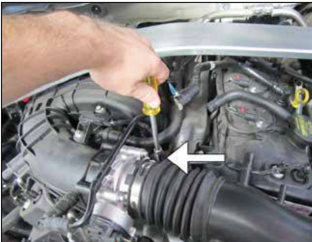
c. Loosen the hose clamp at the throttle body.