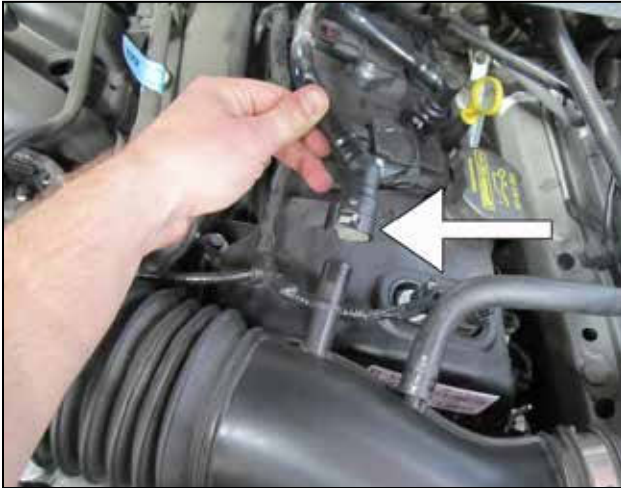
a. Disconnect the crankcase vent line.