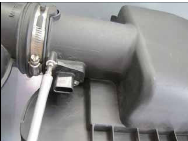
i. Remove the OEM MAF sensor from the OEM airbox and set it aside for future use.