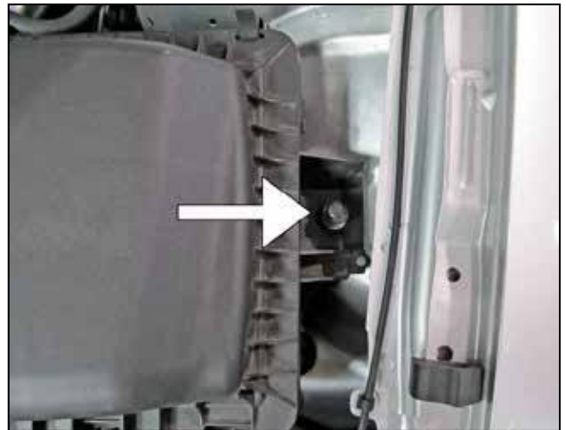
d. Loosen and remove the M6 bolt securing the airbox to the inner fender.