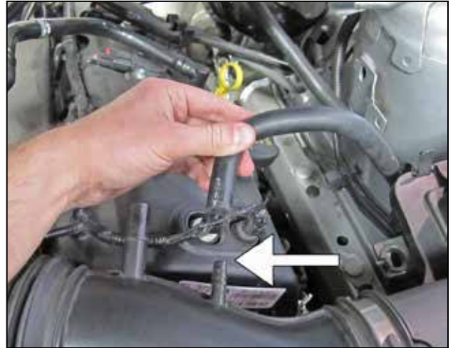
b. Disconnect the brake booster vacuum line.