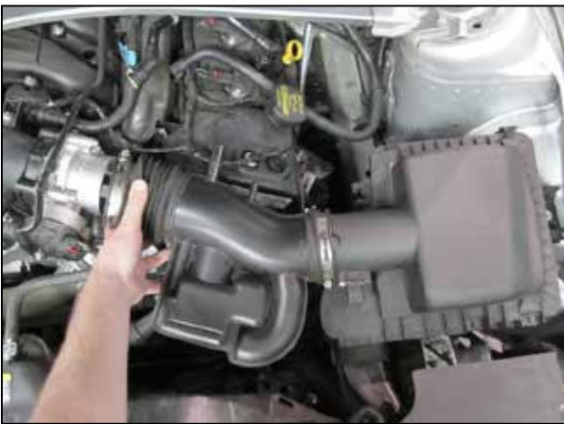
g. Remove the OEM inlet tube off of the throttle body.