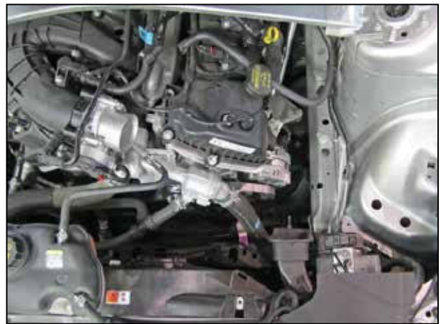
h. Lift up and remove the OEM airbox and intake tube from the vehicle.