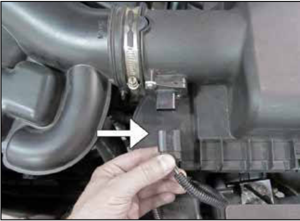
e. Unplug the MAF sensor connector.