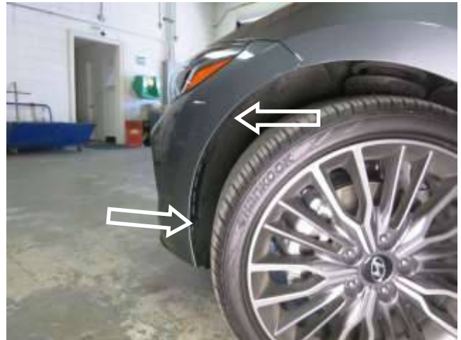
d. Turn the steering wheel to the left and remove the 2 fender liner clips by using #2 phillip screwdriver.