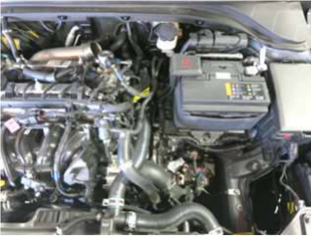
g. Lift and remove the lower air box housing and scoop. AEM recommends that you do not discard the factory intake system.