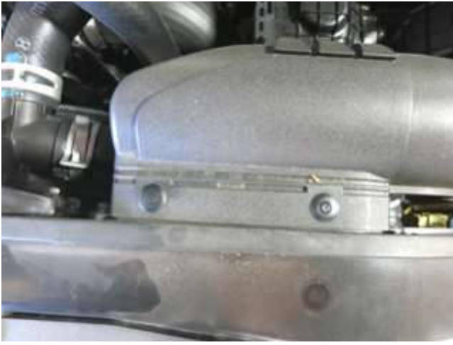
e. Remove the 2 clips holding the air scoop with screwdriver by depressing the center pin.