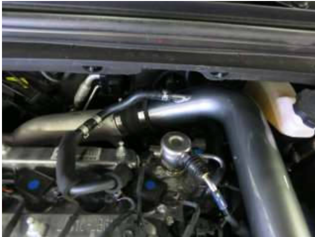
g. Reinstall the PCV hose to the AEM intake tube and secure using the stock spring clamp.