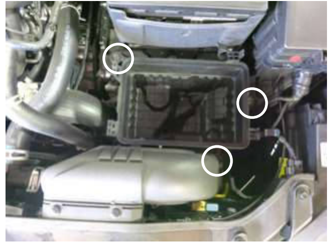
f. Remove the 3 bolts that secure the lower air box housing with a 10mm socket and ratchet.