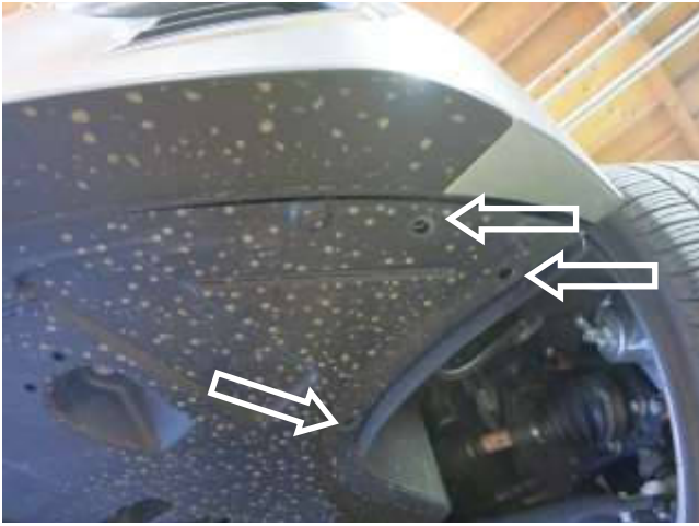
e. Underneath the car on driver side, remove the 3 fender liner clips by using a #2 phillip screwdriver.