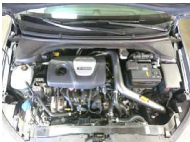
j. Install the engine cover by aligning the post to the rubber grommets, then pressing down until they are seated.