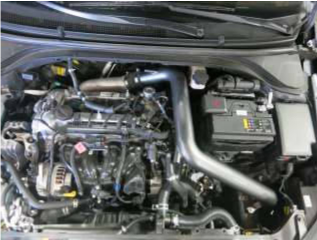
c. Install the AEM intake tube into the coupler, then attach the tube to the 6mm rubber mount with supplied M6 nut and washer. DO NOT TIGHTEN THE BAND CLAMP UNTIL FILTER IS INSTALLED.