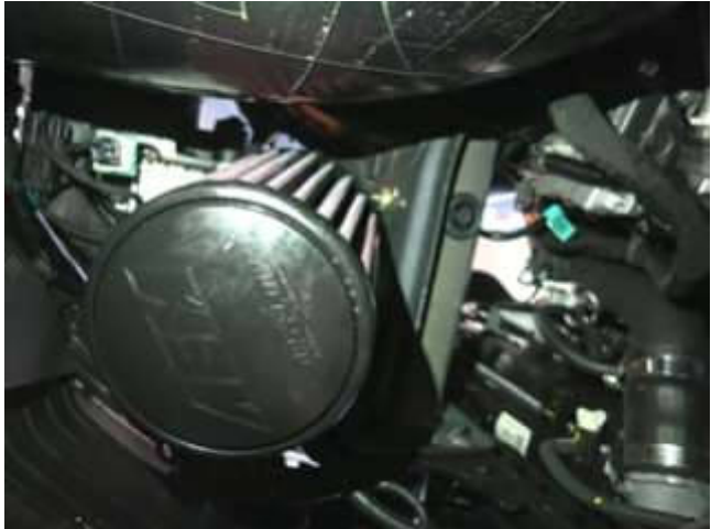
f. After pulling back the fender liner, install the AEM Dryflow filter with provided band clamp into the AEM intake tube , then tighten the band clamp with a 8mm nut driver.