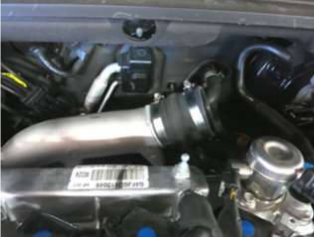
a. Install the supplied coupler and the 2 #44 band clamps. Tighten the turbo tube side only.

a. When installing the intake system, do not completely tighten the hose clamps or mounting hardware until instructed to do so.