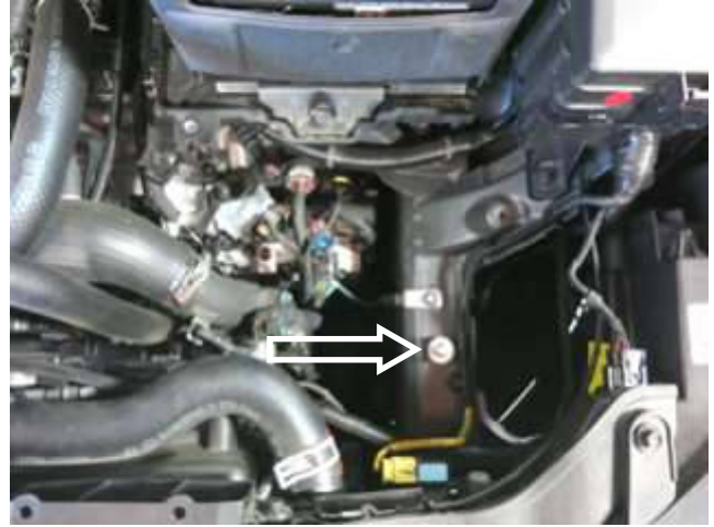
b. Install the 6mm rubber mount in the stock air box mounting hole.