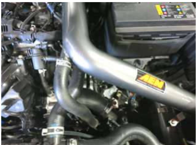
h. Reinstall the recirculation hose to the intake tube and secure using the stock spring clamp.