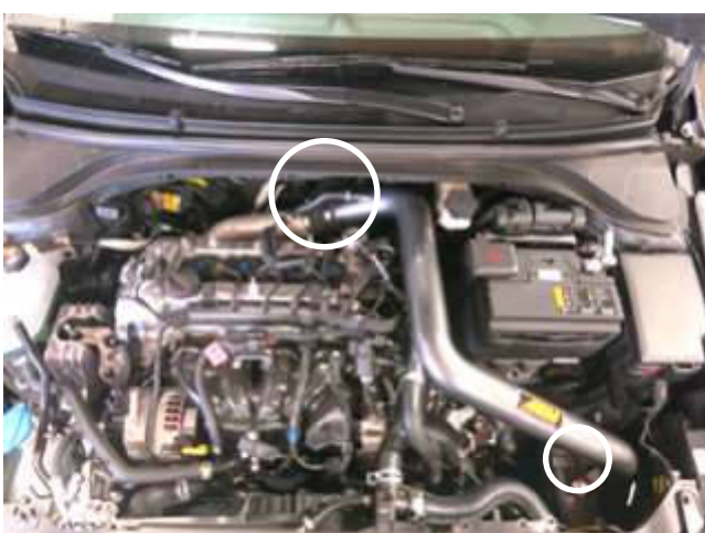
i. Properly align the intake tube to make sure there is clearance, then tighten the band clamp with a 8mm nut driver and also tighten the M6 nut on the rubber mount.