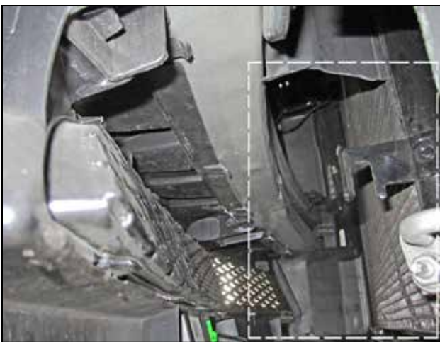
m. 2011-13 Dodge Charger Only: Front deflector after specified area is trimmed.