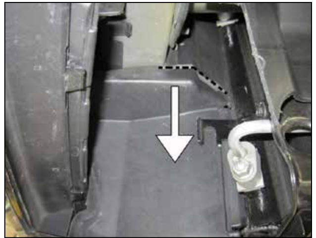
l. 2011-13 Dodge Charger Only: Locate the front deflector and trim the specified area.