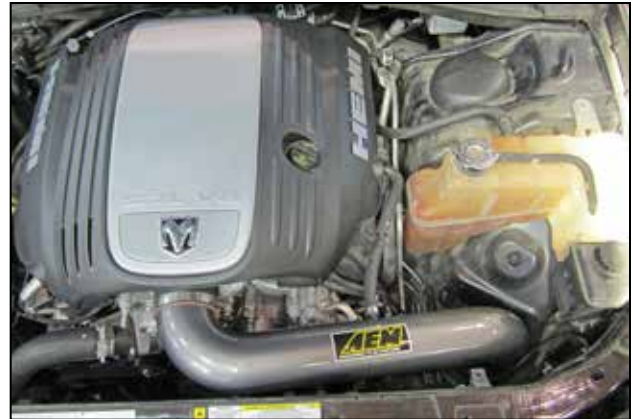
AEM® intake system installed

h. Install the belly pan with the 9 clips, 7 screws, and 2 bolts removed in steps 2f and 2g.