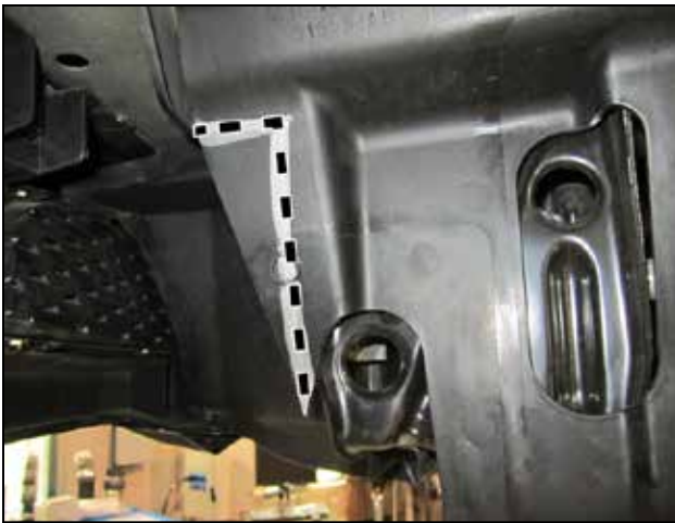
k. 2011-13 Dodge Charger Only: Locate the deflector and trim the specified area.