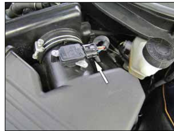
3. Disconnect the mass air sensor electrical connection.