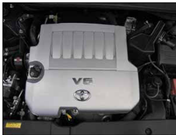
2. Lift off and remove the decorative engine cover.

NOTE: Disconnecting the negative battery cable erases pre-programmed electronic memories. Write down all memory settings before disconnecting the negative battery cable. Some radios will require an anti-theft code to be entered after the battery is reconnected. The anti-theft code is typically supplied with your owner's manual. In the event your vehicles anti-theft code cannot be recovered, contact an authorized dealership to obtain your vehicles anti-theft code.