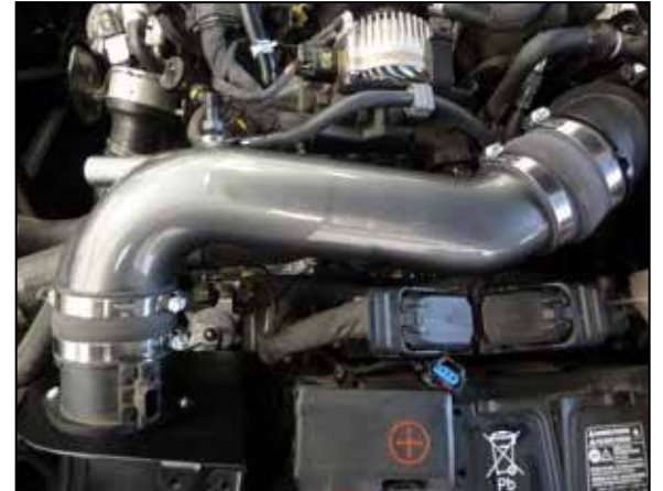
15. Install the intake tube into the hump coupler and then into the straight coupler, adjust for best fit and then secure with the provided hose clamps.