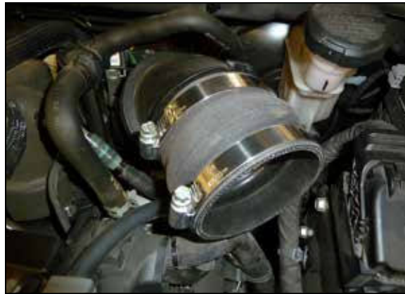
12. Install the provided hump coupler onto the turbo inlet and secure with the provided hose clamp.