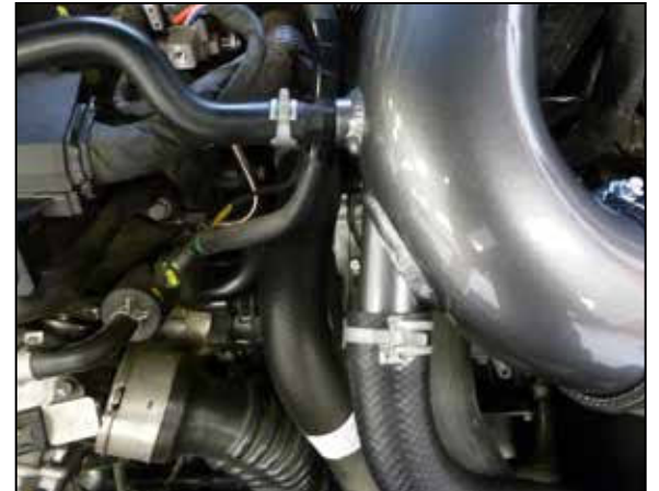
16. Connect the BOV hose and the vent line and secure with the provided spring clamp.