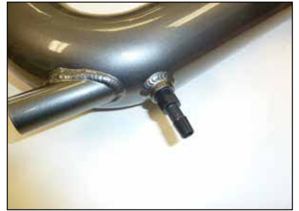
14. Install the provided vent fitting into the K&N intake tube as shown.