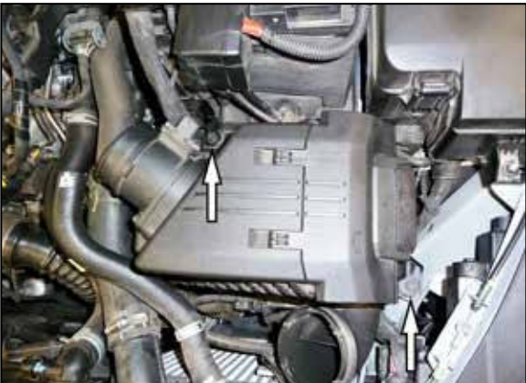
6. Remove the two bolts that secure the air filter housing and then remove the filter housing from the vehicle.