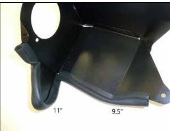
8. Cut the provided edge trim into sections of 11.5", 11" and 9.5". Then install the 9.5" and 11" sections of edge trim onto the heat shield as shown.