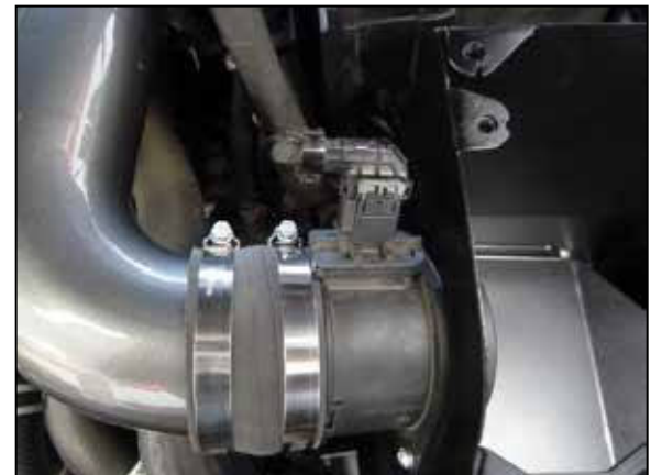
17. Reconnect the mass air sensor electrical connection.