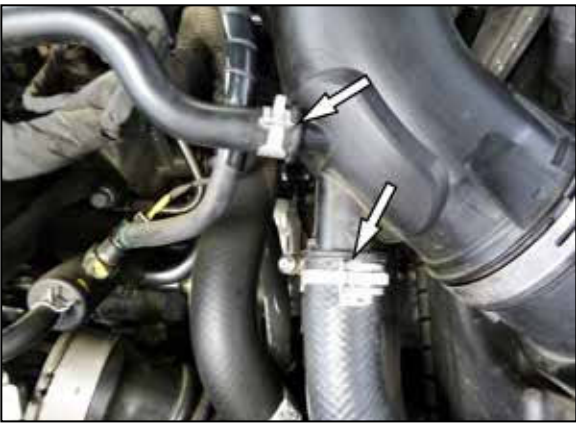
4. Release the spring clamps that secure the BOV hose and vent line, then disconnect the lines from the factory intake tube.