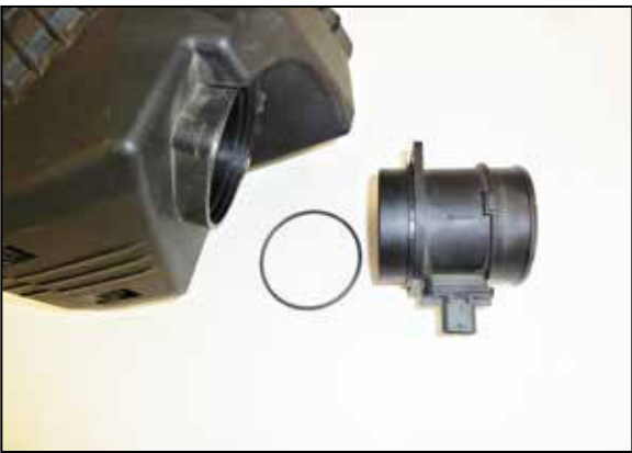
7. Remove the mass air filter from the factory air filter housing and then remove the O-ring seal from the sensor.