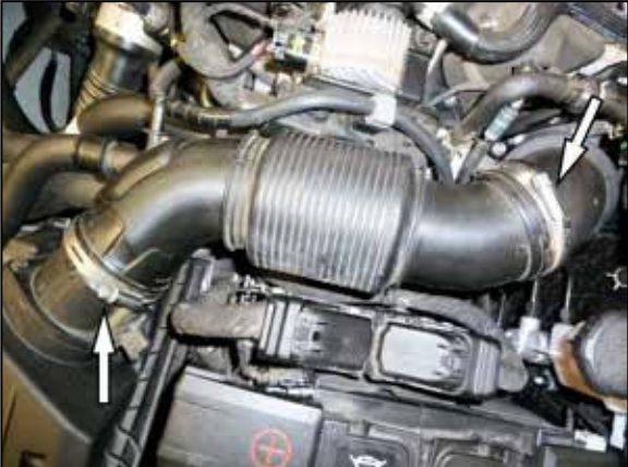
5. Loosen the two hose clamps that secure the factory intake tube and then remove the tube from the vehicle.