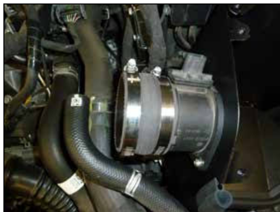
13. Install the provided straight coupler onto the mass air sensor and secure with the provided hose clamp.