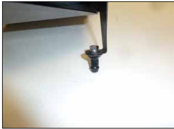
9. Install the mounting post to the heat shield using the provided hardware.