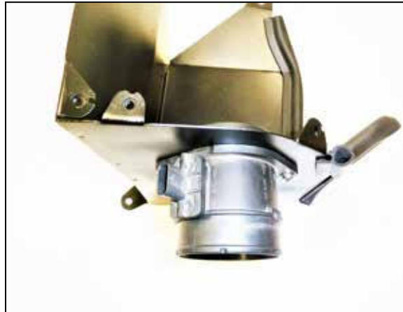
10. Using the provided hardware attach the mass air sensor to the heat shield as shown.