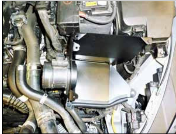
11. Install the heat shield assembly into the vehicle so the mounting stud inserts into the mounting grommet, then secure with the provided hardware.