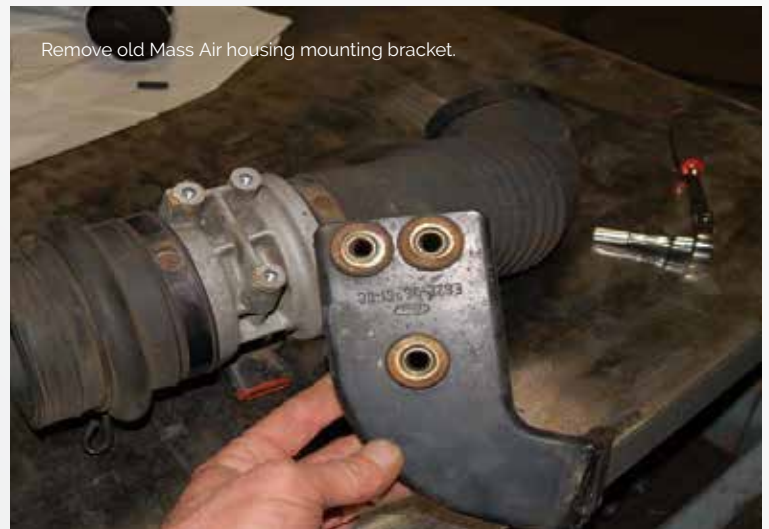
Remove old Mass Air housing mounting bracket.

Remove the stock inlet hoses from the Mass Air Sensor housing. Remove the stock bracket from the Mass Air Meter housing. This bracket will not be reused.