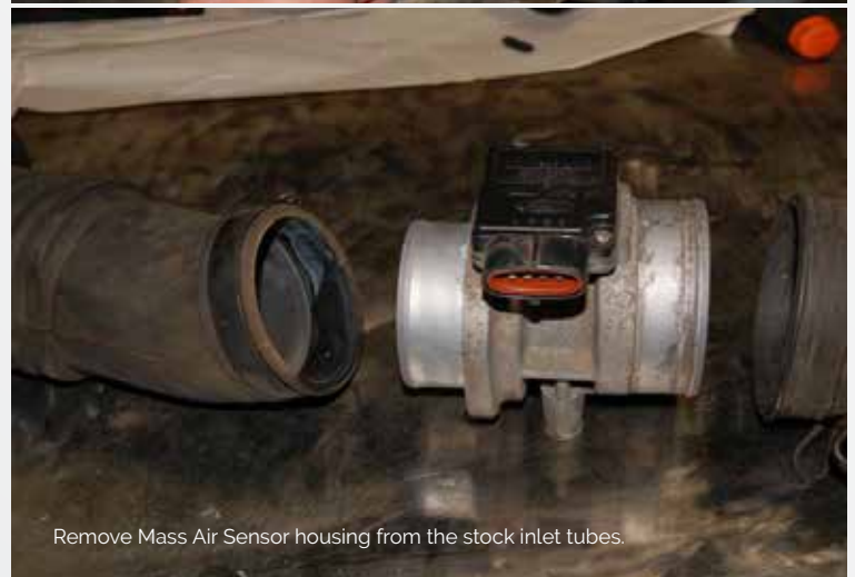
Remove Mass Air Sensor housing from the stock inlet tubes.