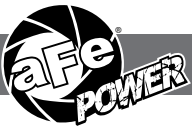
Cold Air Intake