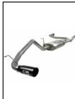
aFe Cat-Back Exhaust