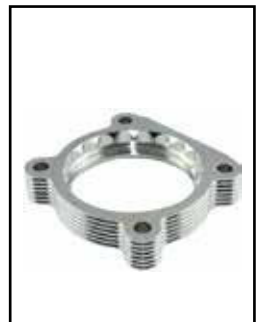
aFe Throttle Body Spacer