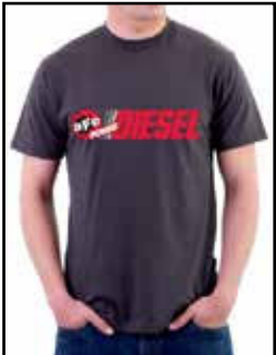
aFe Power Diesel T-Shirt

P/N: 40-30222 (L) P/N: 40-30223 (XL) P/N: 40-30224 (2XL) P/N: 40-30225 (3XL)