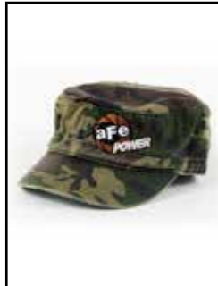
aFe Power Ladies Hat

P/N: 40-10114 (S/M) P/N: 40-10115 (L/XL)