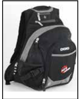
aFe Power Backpack