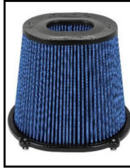
Pro 5R Air Filter Inv.