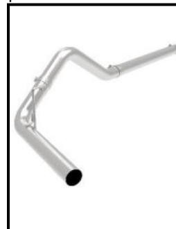
Apollo GT Series Exhaust