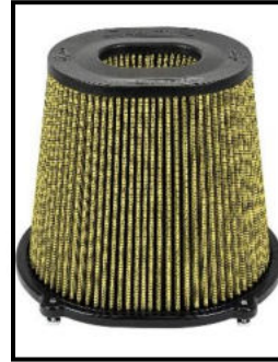
Pro-GUARD 7 Air Filter Inv.