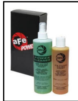
Gold Squeeze Restore Kit