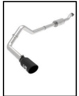
Vulcan Series Exhaust