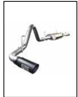
aFe Cat-Back Exhaust