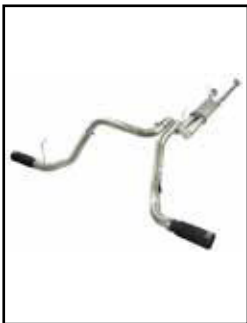
Dual Cat-Back Exhaust

P/N: 49-46014-B (Blk Tips) 49-46014-P (Pol Tips)