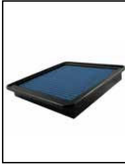
OE Replacement Air Filter

P/N: 30-10146 (P5R) 31-10146 (PDS) V8-4.6L/5.7L '07-'13