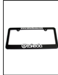
Lic. Plate Frame