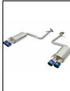
Takeda Axle-Back Exhaust

P/N: 49-36037-L (Blue Tips) 49-36037-P (Pol. Tips) (For Lexus RC 350/300)