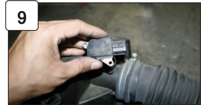
Install housing into vehicle and position. Secure housing using provided M6 screws and flat washers. Tighten using 10mm socket or wrench.