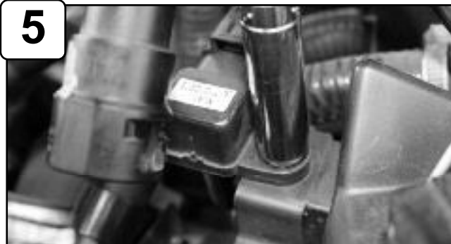
With 10mm wrench loosen VSV valve on air box, disconnect and remove. Save for later install ( See step 11 ).