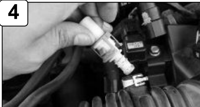
Disconnect Crank case line and remove plastic fitting. Save for later install ( See step 11 ).