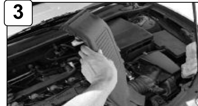
Remove plastic battery ram air.