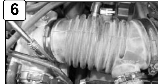
With 10mm socket or wrench loosen clamps on stock intake.