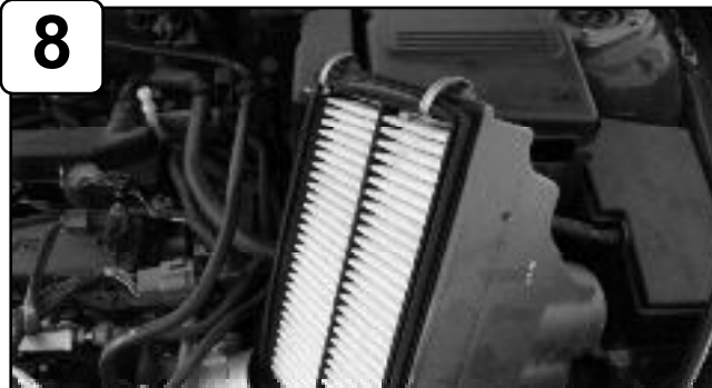
Remove bottom half of air box.