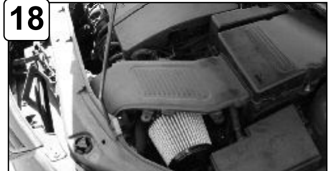
The installation of your Takeda performance intake is now complete. Please check all components and re-tighten if necessary. Thank you for choosing Takeda!

Place the included CARB EO sticker on or near the intake system on a smooth, clean surface. E.O. identification label is required in passing the smog check inspection.