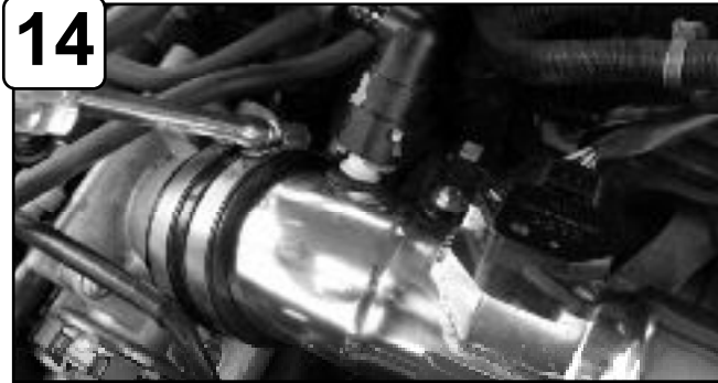
Tighten clamps using 5/16" nut driver. Connect crank case line. Connect VSV harness. Reconnect MAF sensor harness.