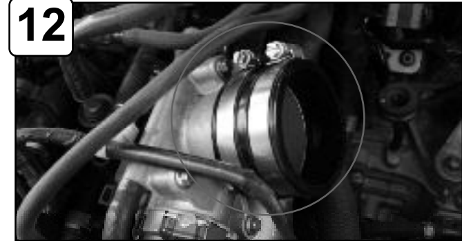
Attach coupling with clamps provided to throttle body. Do not tighten.