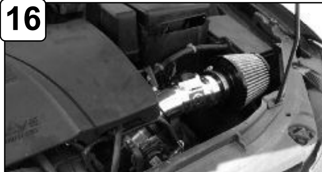
Install engine cover.