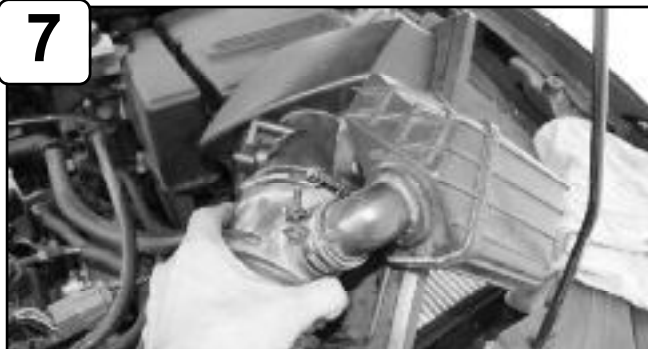
Lift and remove upper half of air box.