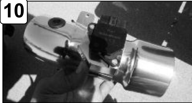
Install grommet to tube. With M4 screws provided secure MAF sensor to new intake tube and tighten using flathead screwdriver.