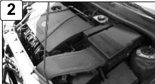
Complete Stock intake. Please disconnect battery terminals before installation.