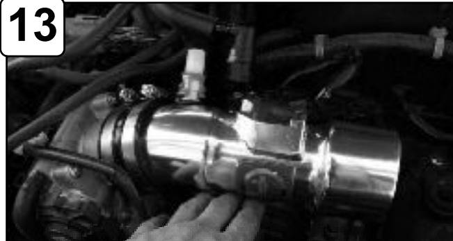
Install tube and position.