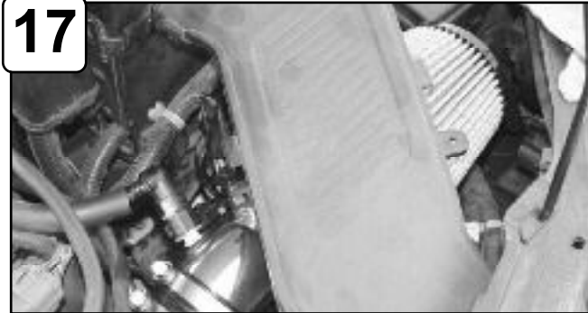
Install plastic battery ram air.