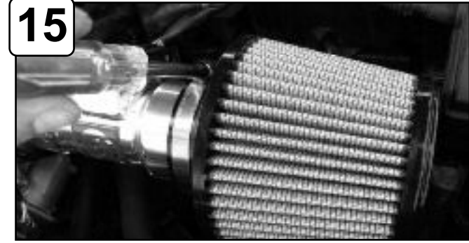
Install air filter and tighten using 5/16" nut driver.