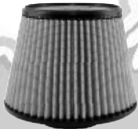
Replacement Filter P/N: TF-9003D