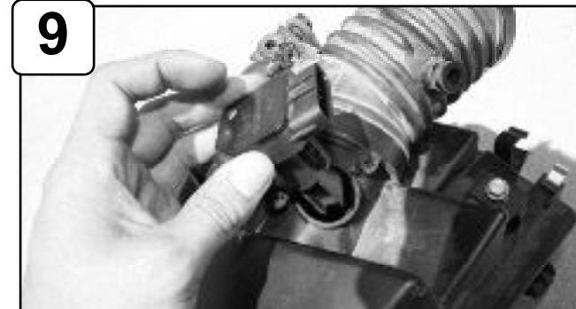
With phillips screwdriver, loosen and remove MAF sensor from stock air box.